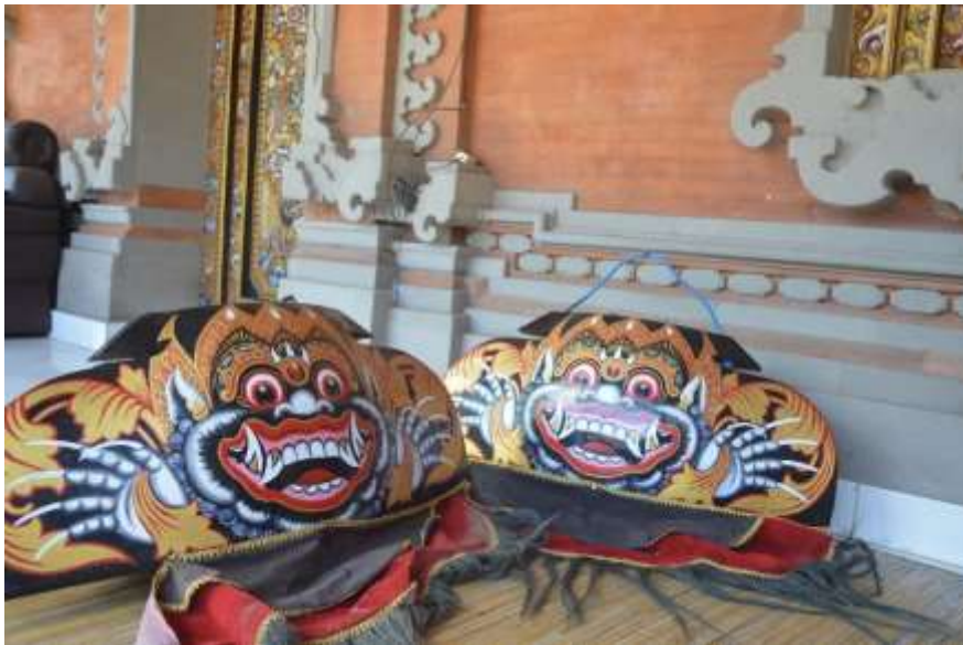
Figure 3. One of Okokan Instrument

The significance of the value of the noble value of the art of the show Okokan consists of the value of the family in the representation of folklore, the value of life safety of Ida Sang Hyang Widhi from Banten prepared, the value of work ethic in doing Dance movements, and the value of life balance between humans and nature. Okokan images used during performing arts events. Equipment used like wood Okokan , Poleng pants in Okokan show can be seen on the figure 3 and 4.