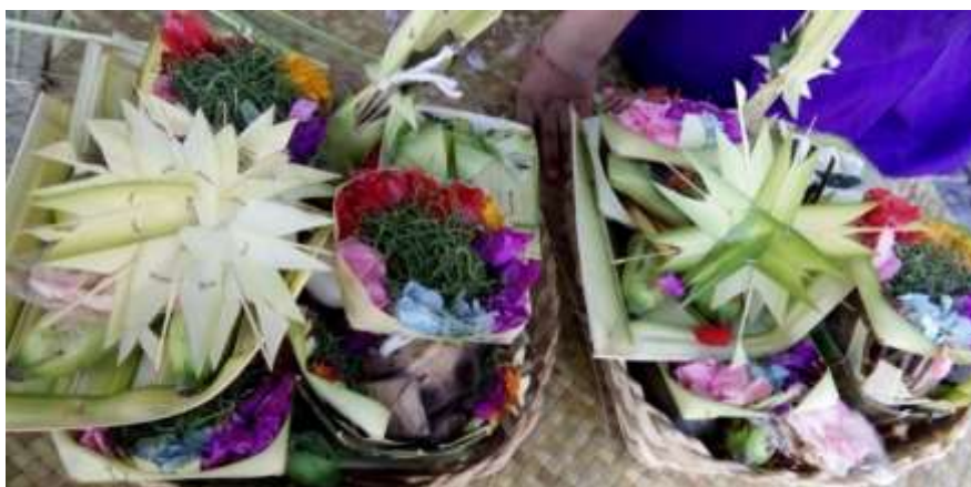
Figure 2. Banten Pejati for Okokan Art Performance

by the belief of Bali's customary social system which believes in the presence of Ida Sang Hyang Widhi in the tradition. Here is a picture of banten pejati that used to show Okokan art.