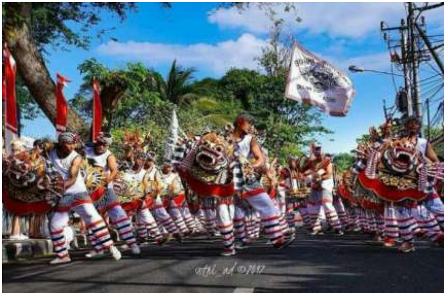
Figure 4. Two Okokan Performances

The activity in the picture above is a manifestation of Okokan art performers wearing Poleng (black and white) pants attributes during the PKB Event and Penggrupukan Day before