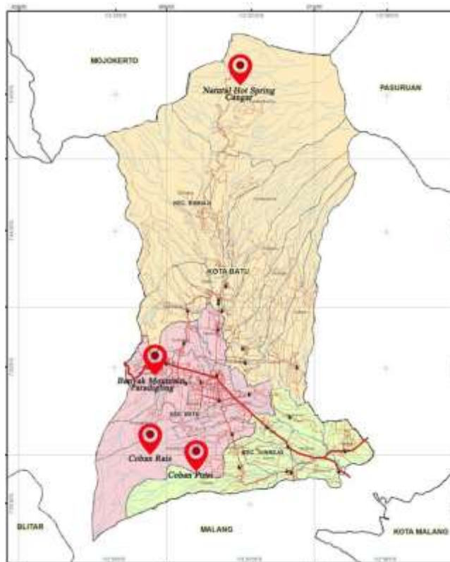
Figure 1. Map of Batu Municipality (BPS Batu, 2017)