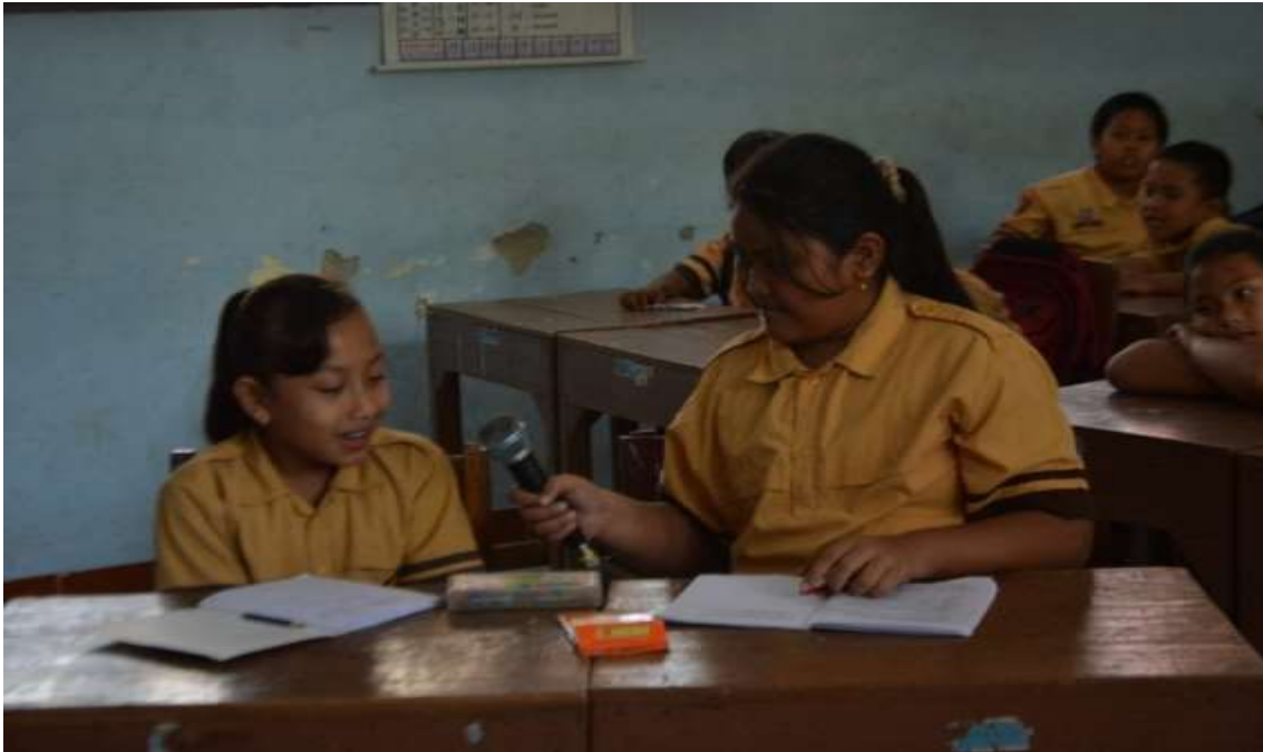
Figure 2. Psychodrama by fifth grade students of Jabungan State Elementary School.

Character Values) through PSIKODRAMA. We teach this method to Jabungan State Elementary School students in a series of Anti-Corruption Education Scientific Work (KKN) activities. The implementation of this program begins by providing an understanding of 9 anti-corruption values to 5th grade elementary school students, after which division of roles is performed and provides text drama to 5 students who have been selected to play the drama Planting 9 anti-corruption values.