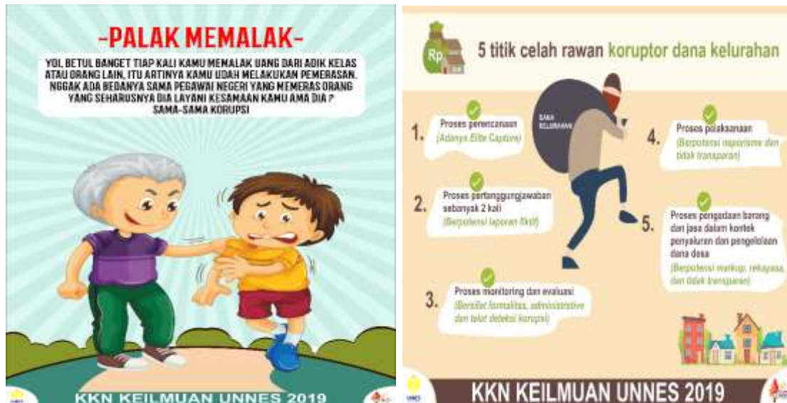
Figure 3. Infographics of Anti Corruption.

gain a deeper understanding so as to achieve emotion. Important events are played back to help clients connect with feelings that are not revealed and not realized, providing a channel for full disclosure of these feelings, leading to new behavior. 13