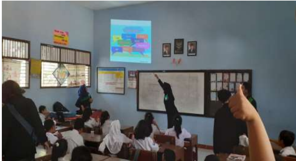
Figure 1. Anti-Corruption Week Socialization at SDN Jabunganan.