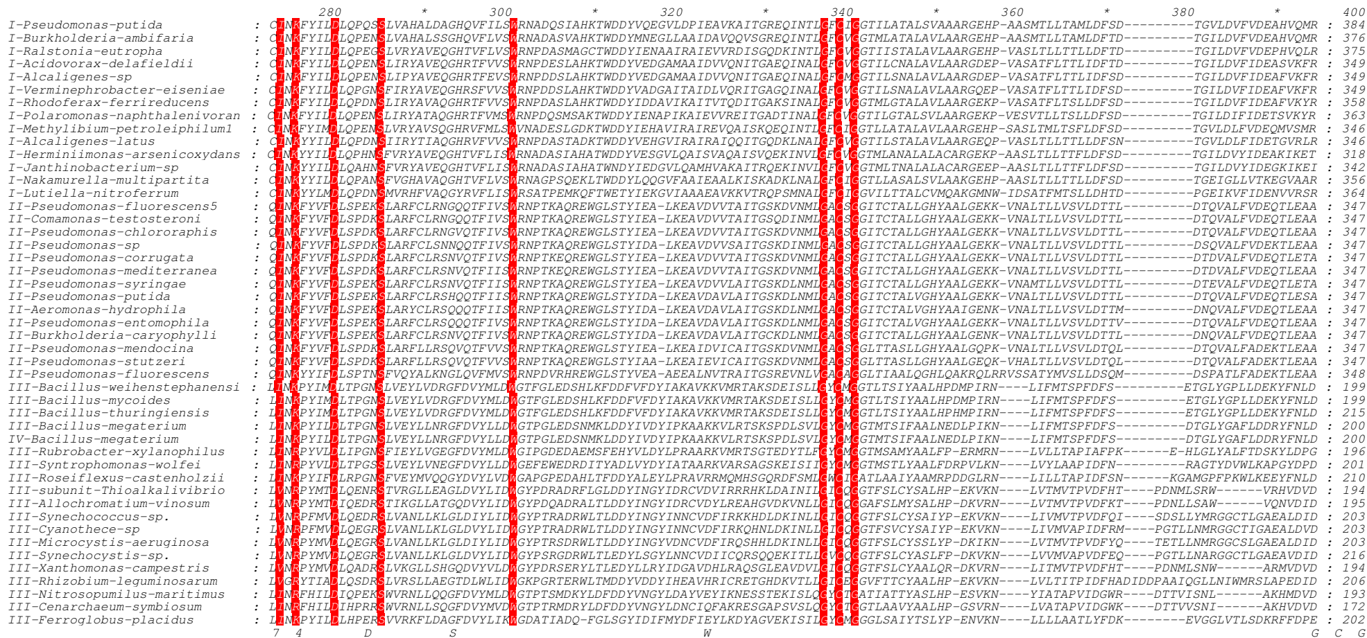
Fig. 2: Part of the multiple amino acids alignment of different PhaC synthases, shaded lines show different conserved regions.