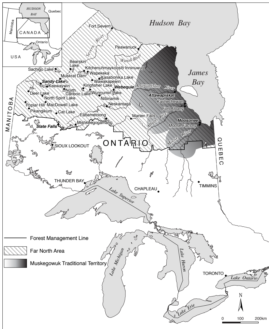
Figure 3. The First Nations of the Far North region are illustrated. The First Nations and the one community (Moosonee) in the Far North – where hearings were scheduled by the Government of Ontario, but later cancelled – are bolded and in italics. The names of cities where Far North hearings were actually conducted – all were outside the Far North region – are presented graphically with all letters in capitals. The figure is based on the Far North map of the Ontario Ministry of Natural Resources (2010).