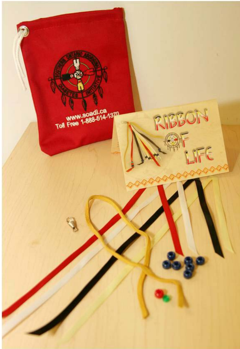
Figure 2. In partnering with the SOADI, the Ribbon of Life was used as the Talking Circle symbol to represent the Aboriginal woman's struggle to prevent gestational diabetes.