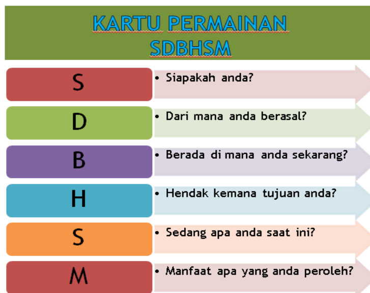
Figure 2. Side B of the SDBHSM (Rahman, 2018)