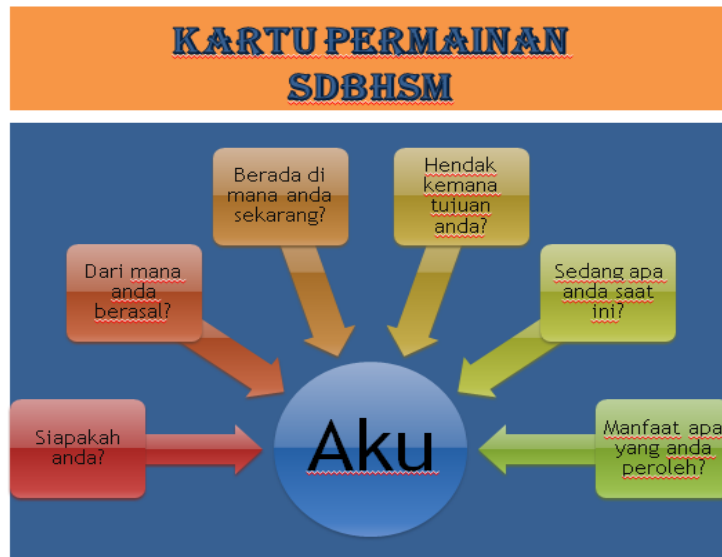
Figure 1. Side A of the SDBHSM (Rahman, 2018)

by being given basic guidance service on the nature of human beings. The last session, participants were asked to answer six questions on the same card inside B to find the most essential and deep answers.