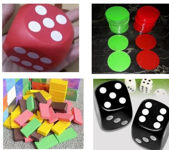
Figure 1. Tactile Media for learning opportunities, permutations and combinations