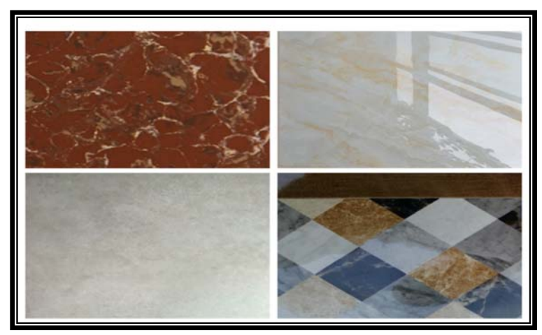
Figure 1. Some porcelain tiles used in the present work.

Eight commercial porcelain tiles were gathered from various different markets and industrial facilities. The tiles were picked from most regular Iraqi markets, see Figure 1 . Each tile was pounded into small pieces, then into fine powder by utilizing jaw crusher. The tiles were dried at 100 °C for one hour to guarantee that any moisture was expelled from the tests. In order to acquire uniform molecular sizes, a (500 \mu m) mesh was utilized, and then, the tiles were weighted (one kg) and transferred to a Marinelli beaker. The HPGe system which was used in the present work was a (3×3) inch, see Figure 2 . A fundamental prerequisite to estimate a gamma producer was the character of photo peaks showed in the spectrum made by the detector system. Calibration of energy was done by utilizing a standard source of Marinelli beaker of Eu-152, set up with energies (411.1, 344.3, 1408.0, 964.0, 444.6, 778.9, 1085.8, 121.8, 1112.0 and 244.7 keV).