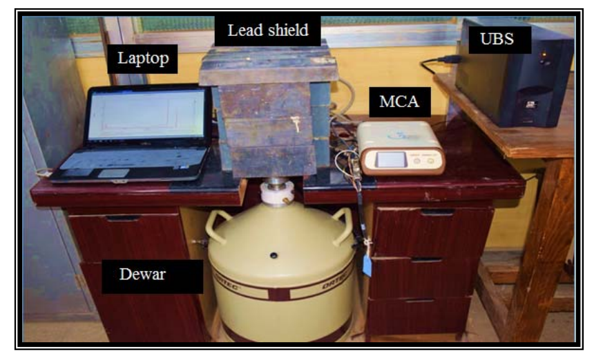
Figure 2. HPGe system used in the present work.