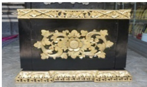
Figure 11. Plawah Selonding with patra sari design, 2019

ves as its identity, as indicated by the name patra sari (see Figure 11).