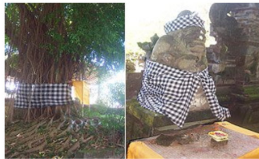
Figure 7. Poleng cloth esused as tree and statues decoration, 2019

Indeed, the plawah decorated with poleng cloth is identical to the plawah lelengisan in shape and size; the visible portion of the plawah is decorated with poleng cloth. Supartha (2001, p. 9) defines poleng cloth as a 'Balinese color' with a black-and-white checkerboard pattern. Poleng cloth appears to have become an integral part of Hindu life in Bali. Poleng cloth is not only used for sacred religious purposes; it is also widely used for profane or secular purposes. Poleng cloth is used to decorate trees and statues, giving them a supernatural appearance, as shown in Figure 7.