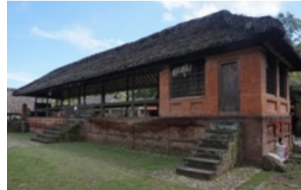
Figure 1. One of the Bale Patemu in Tenganan Village

led and have never been struck are stored at Patemu Kelod (see Figure 1) and are carried and brought in a ceremony on specific days and times.