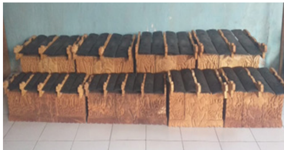
Figure 10. Plawah Selonding with pepatraan carving design, 2018