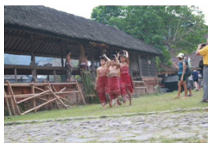
Figure 3. Tenganan Village as tourist destination, 2019

Village's inheritance of Gamelan Selonding , with its uniqueness, has the potential to attract tourists. Selonding was initially a non-commodity product that evolved into one. According to Barker's (2014, p. 41) definition, a commodity is an item whose primary function is to be sold, in which objects, qualities, and signs are transformed into commodities. Commodities are all things that seek market legitimacy through the process of commodification, transforming into an image world packaged as a commodity.