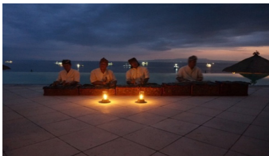
Figure 13. Selonding presentation as a tourism art performance by Sanggar Guna Winangun at Hotel Amankila, Karangasem, Bali, 2018.

as a tourism performance art since 1992 (see Figure 13). Selonding is a significant part of the dinner event at the Amankila Hotel in Manggis, Karangasem, Bali, under Sanggar Guna Winangun.