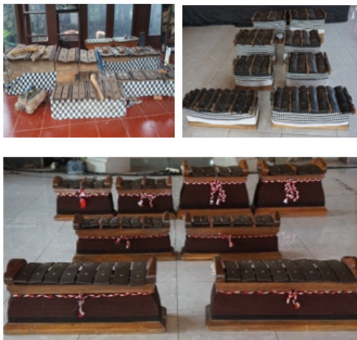
Figure 9. Gamelan Selonding with Poleng and tri datu colormotives and decorations , 2019

The same philosophy is reflected in the poleng tridatu cloth, a three-color poleng cloth composed of white, red, and black. The tridatu's color represents Triguna's teachings, specifically satwam, rajah, and tamah . When combined with TriMurti , the red color represents Lord Brahma as creator, the black color represents Lord Vishnu as preserver, and the white color represents Lord Shiva as fuser.