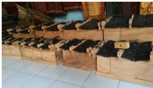
Figure 6. Selonding with plawah lelengisan , 2019

The plawah of Gamelan Selonding is generally shaped like a crate and comes in three sizes: large, medium, and small. The large size measures 65 cm in length, 35 cm in width, and 35 cm in height; the medium size measures 55 cm in length, 25 cm in width, and 25 cm in height. The small version measures 75 cm in length, 20 cm in width, and 20 cm in height.