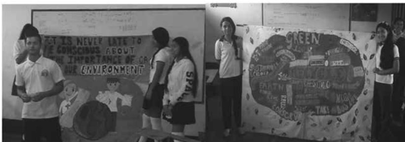
Figure 6. Students presentations about environmental concerns to the whole school.

A final aspect to be analyzed is related to students' language improvement. Accordingly, through the development of different artifacts and the use of the language in different scenarios, such as presentations, speeches, and controlled practices, we could notice that the level of effectiveness of implementing negotiated syllabus through community based projects was beyond the expected results due to the fact that most of the students showed a notorious improvement in the use of English to communicate ideas and also to relate that language in a meaningful way in the sense that it was connected to their realities and their community. Community Based Pedagogy and Negotiated curriculum also served us as mediators for taking actions to solve a community problem and at the same time to strengthen the use of English to communicate with others instead of seeing it as an isolated subject as shown in Figure 6 .