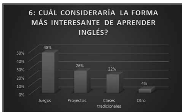
Figure 2. Statistics from the needs analysis, where the majority of the students expressed their learning preferences.

be acquired using a non-traditional method and the issues in their community can be used as an alternative manner to address those contents.