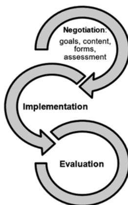
Figure 1. Negotiated syllabus involves three steps: negotiating the goals, content, forms and assessment of the course; implementing these negotiated decisions; evaluating the effect of the implementation in terms of outcomes and the way the implementation was done and this would lead to a return step (Nation & Macalister, 2009, p.152-153).

Designing a negotiated syllabus is time-consuming due to it implies not only contributions based on our experiences as teachers but also, and most important, it implies student's needs analysis. Taking into account students voices is what makes negotiated syllabuses successful due to the fact that it develops learner's autonomy. According to Nation and Macalister (2009) "A negotiated syllabus involves the teacher and the learners working together to make decisions at many of the parts of the curriculum design process" (p.149). In this way, we give recognition to students' voice by providing the opportunities to decide some activities and topics of their interest. It also means contents are organized and developed according to students' needs and interests (Ortiz, 2006, p.11).