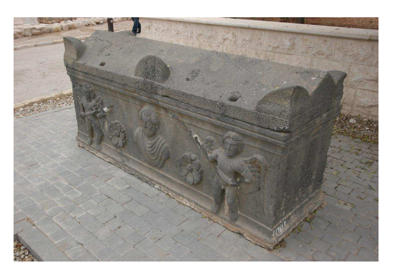
Figure 6: Sarcophagus

As a small case project, a set of 15 images taken by calibrated Canon 20D with 8MPix was used. For simple documentation the decorated sarcophagus beside the Hercules Temple on the Jabal al-Qal'a, also called Amman Citadel was selected. All images was taken from hand within two minutes only. After manual referencing of all images, only those with approximately parallel axes were processed to a point of cloud. Within only a few minutes about 500 thousand object points from one decorated site were captured. The created point cloud was rendered with quality textures from images. All the images cannot be processed by automated image referencing – the overlap between images was not sufficient for creating complex model; thus only 8 images from the decorated part were processed. The Photomodeler software computes cloud of points always from a pair of images only without control or verification and with many errors (noise). The software options are limited and it is clear that it will be enhanced.