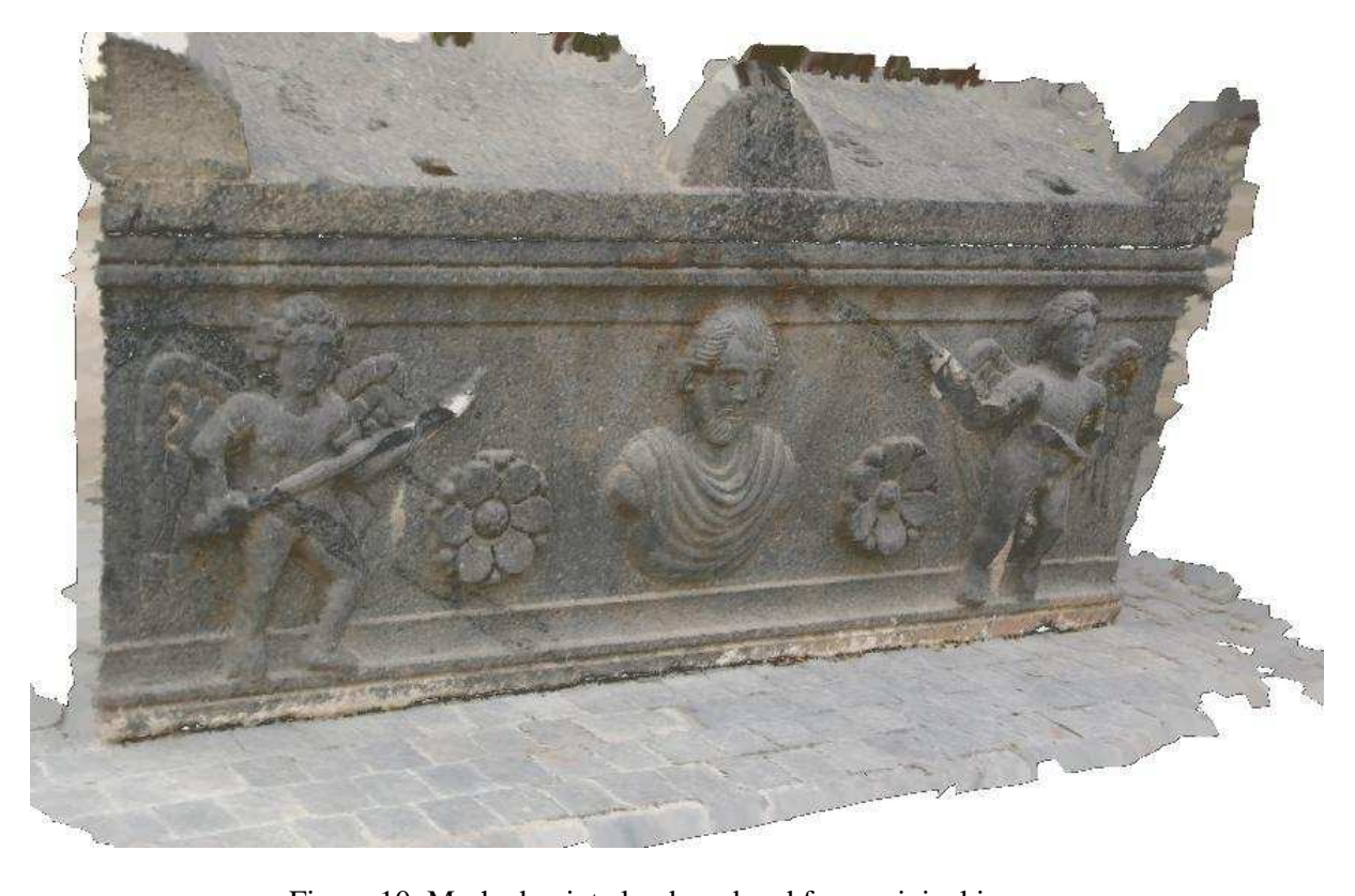
Figure 10: Meshed point cloud rendered from original images