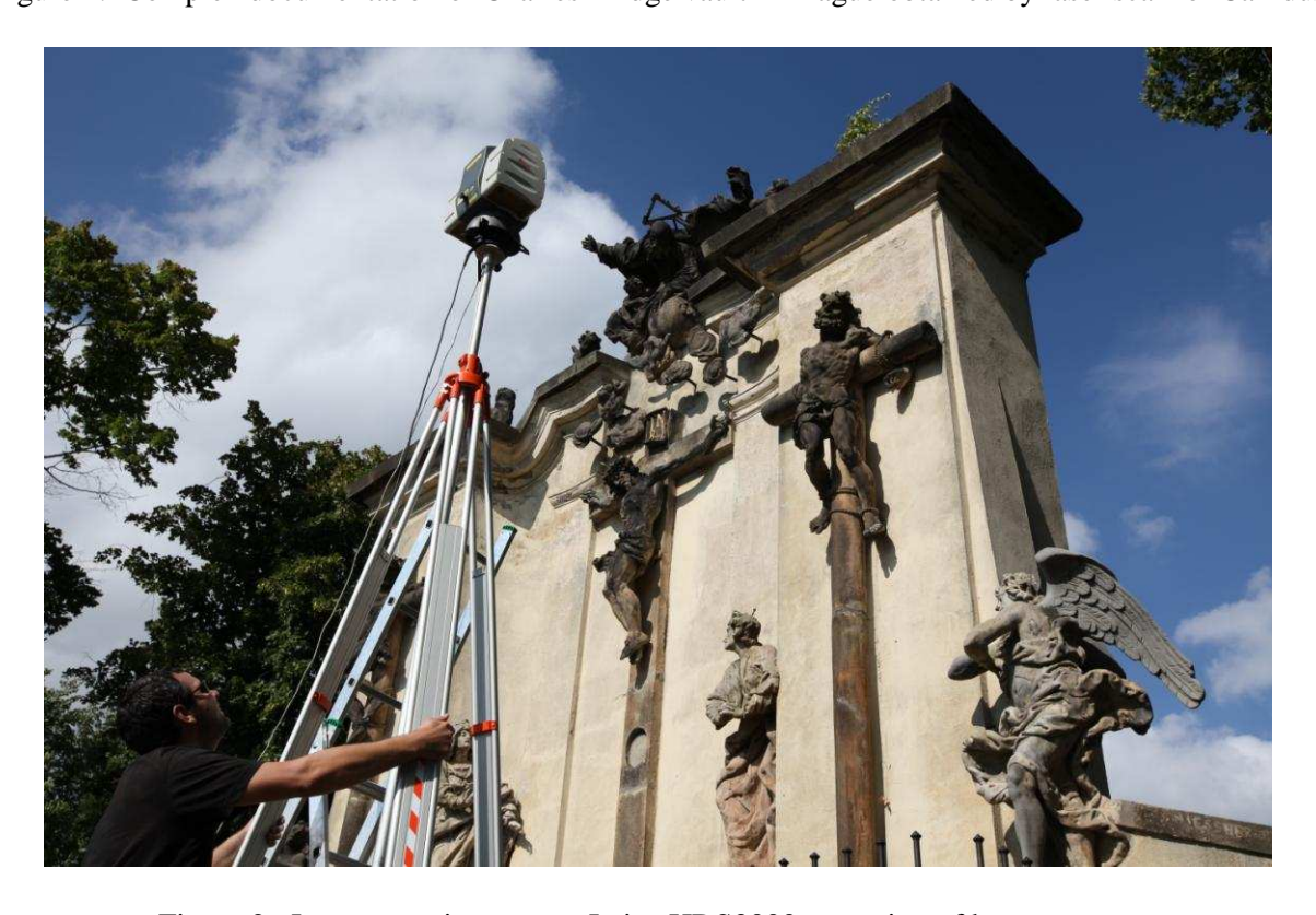
Figure 2: Laser scanning system Leica HDS3000: scanning of baroque statue