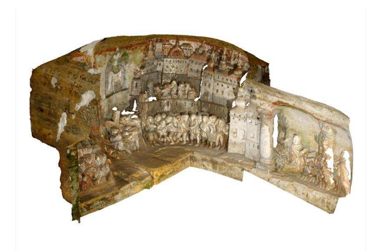
Figure 5: Final 3D model of one part of the relief with texture (Baroque-age relief near Velenice village in the Czech Republic)