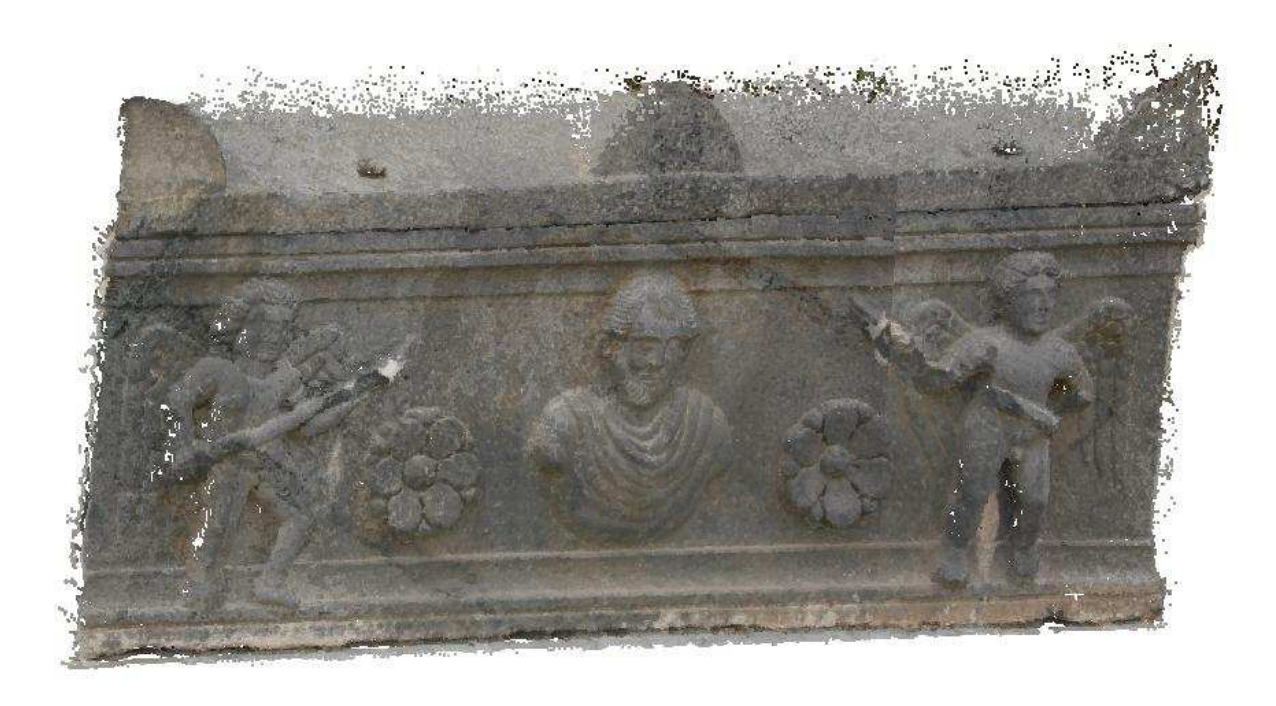
Figure 7: Output from Photomodeler software

For image acquisition, a digital camera Canon 20D and Canon 10-22 mm lens were used. The use of an ultra-wide lens required a very precise calibration, for which several software solutions were used (Photomodeler v6 and self-made software in Matlab language). The parameters of focal length, principal point, radial and decentric distortions and chromatic aberration were calibrated in dependence on used lenses. The planar calibration field for SW Photomodeler, extended with four points in space, was captured from 16 different positions. The images were firstly converted to the original Bayer scheme with SW Dcraw and then separated into three independent greyscale images (RGB) with the quarter of the original resolution. Then the calibration process was made in SW Photomodeler independently for each channel and the resulting parameters were saved to the common input file for next computing in SW Matlab. Next, the parameters were balanced in order to have one common focal length for all channels and also in order to take advantage of the whole image format after distortion repair (similar to idealization process in SW Photomodeler – however, this software does not compute chromatic aberration). Finally, the calibration protocols in Matlab were generated and used for image optimization (idealization - creation of a new photo set without image distortion) of the photogrammetric images.