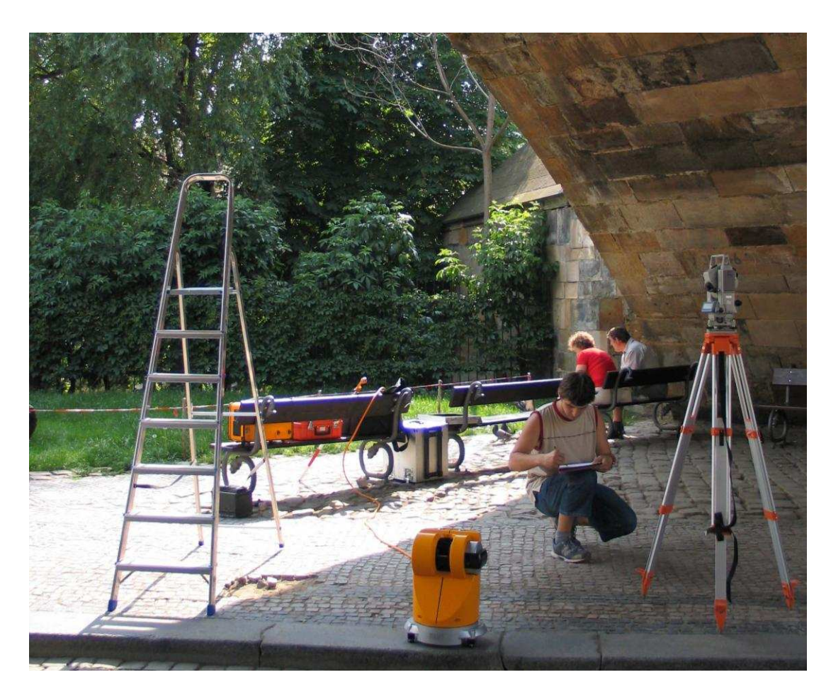
Figure 1: Complex documentation of Charles Bridge vault in Prague obtained by laser scanner Callidus