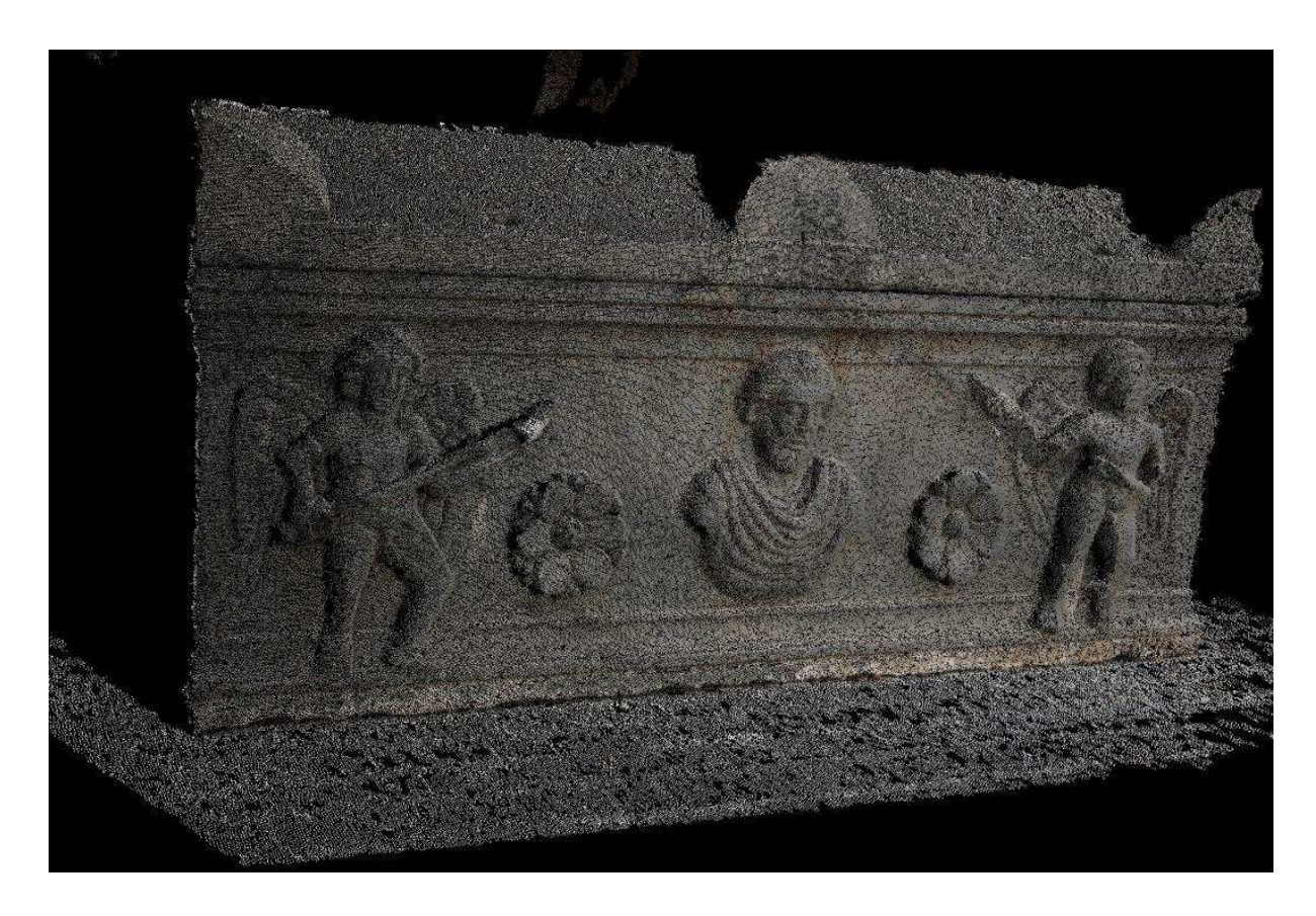
Figure 9: Point cloud created from images