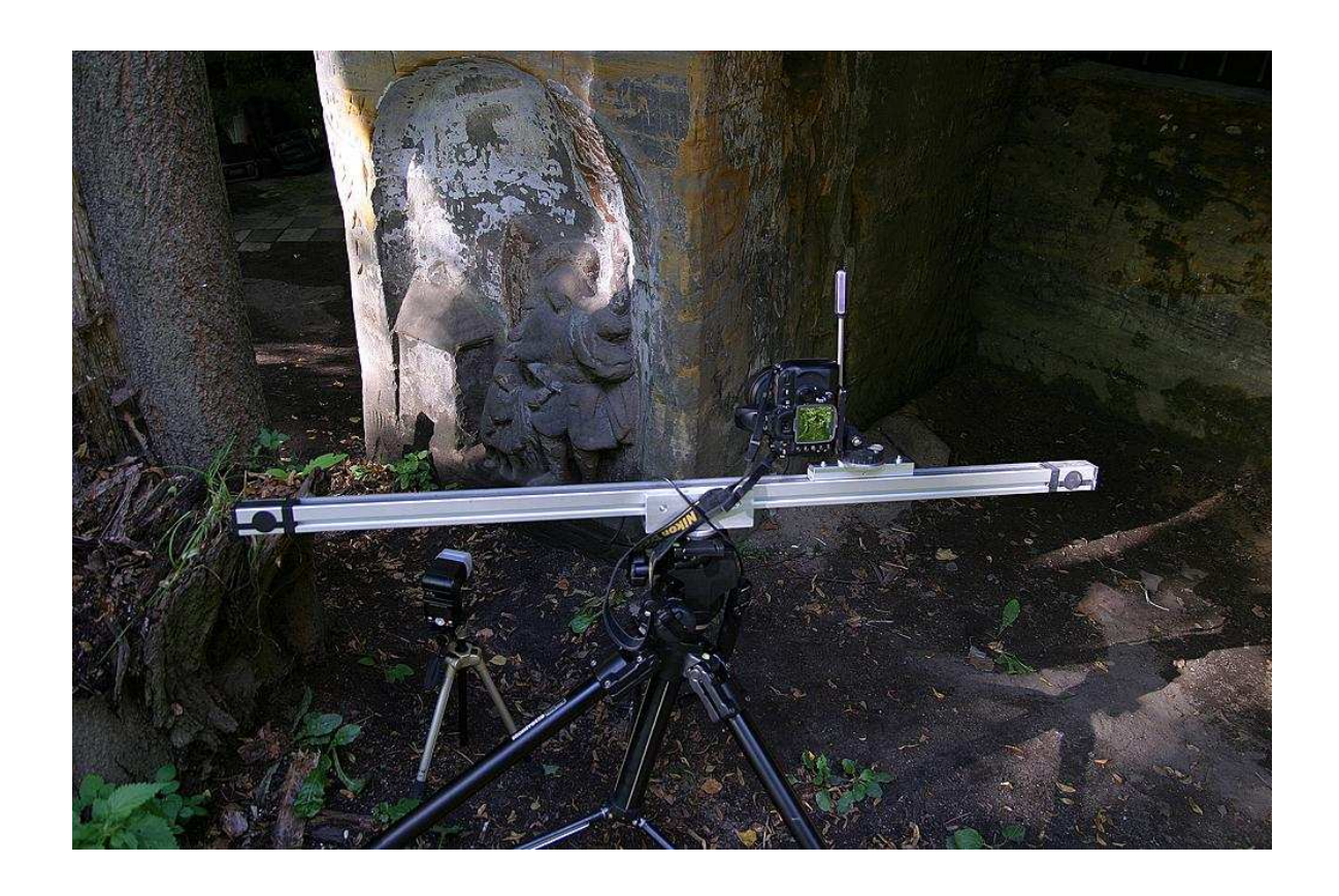
Figure 4: Optical Correlation System (OKS)