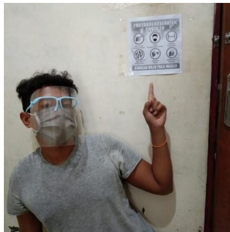
Figure 6. Reminded of health protocols via embedded pictures.

The family has a role in family health care to achieve the health conditions of all family members (Harmon Hanson, 2005). After undergoing treatment for about 3 weeks, my husband, my big son and my mother were declared cured with a health certificate from the hospital. This situation made my family happy and thanked God for His great love and I feel very proud of my husband, children and mother who have managed to go through the treatment and treatment period courageously and patiently by going through the swab examination process many times until finally the result is negative.