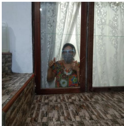
Figure 2. My mother is behind the glass window during self-isolation or quarantining in the room

For my family members who suffer from Covid-19, treatment is carried out using independent isolation techniques both in the hospital and at home. This can make them feel alone and unnoticed. Quarantine conditions will increase anxiety and isolation which can cause a person to experience anxiety and depression. Conditions will be increasingly depressed because our culture is accustomed to establishing a social relationship with other people and because of the confirmed condition of Covid-19, the activities of family members must be limited so that they need the support of others, especially family. When cases of COVID-19 become a pandemic, WHO asks citizens to stay at home or self-quarantine. Sports centers and locations that are usually crowded with individuals are temporarily closed. Residents have to stay at home for long periods of time, this can pose a huge challenge to staying physically active. Sedentary behavior and low levels of physical activity can negatively impact an individual's health, well-being and quality of life. Quarantine itself can also cause additional stress and can disrupt people's mental health. Physical activity and relaxation techniques can be used as good ways to help achieve calm and maintain physical and mental health. The family facilitates in order to keep doing activities that are safe and healthy for all family members (Sari, 2020).