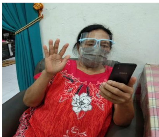
Figure 4. My mother made a video call with her sister and always make them happy