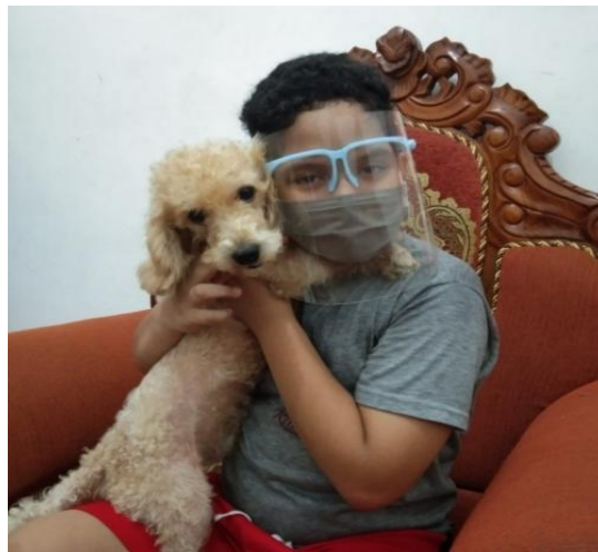
Figure 3. Playing with pets can be comforting in sorrow with due observance of health protocols

The family is part of a social being and is also an emotional creature, in which family support must be provided with the right techniques so that support can be felt and interpreted by the family properly, one of which is in the form of emotional communication. The ability to communicate emotions through emotional intelligence reminds us that emotions are part of our humanity and will always be present with us. Our presence through good emotional communication will make families able to survive the current pandemic situation. When we feel wrong, we dare to admit it and when we are right, we try to remain calm and quiet. When my son forgot to wash his hands after playing with his beloved dog, he spontaneously said "Ouch I forget" and then he rushed to wash his hands immediately. Family facilitates family members to stay healthy, happy with everything around them. Positive and effective communication in the family will foster a sense of security and comfort for all family members during the COVID-19 pandemic (Rayani, 2021)