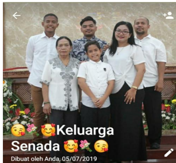
Figure 5. Similar Family Groups on social media (WA)

Another form of communication is that I try to make us all open up to each other by expressing our feelings and thoughts, when my husband had to be hospitalized and my child and mother were isolated independently at home. My family used online media, for example to create a "Senada" family group to be able to communicate online because of the pandemic condition, we must keep our distance.