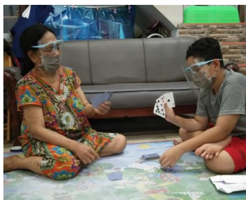
Figure 8. They can play together again and be happy while adhering to health protocols.