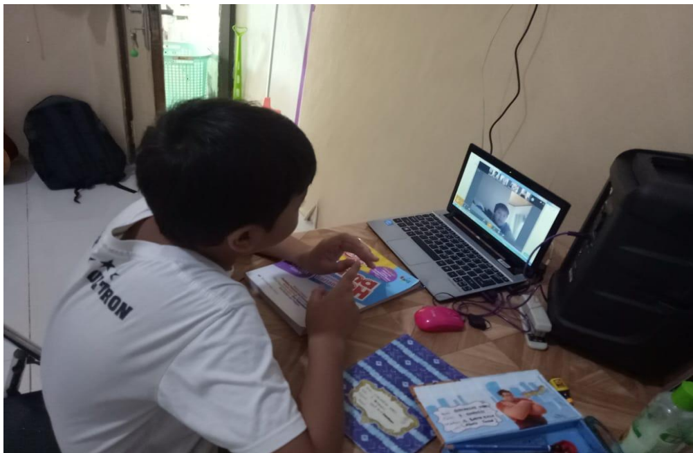
Figure 4. Online learning decreases children's learning experience (Wiresti, 2020; Wulandari and Purwanta, 2020).

Online learning or distance learning itself aims to meet of the use of information technology connecting students and teachers. Educators, parents and children change learning modes with various online methods such as Whatsapp application, Zoom Meeting, Google Classroom, Email, and other applications. As a result, time and space of using the gadgets or laptops are inevitable (Basilaia, G. & Kvavadze, D., 2020).