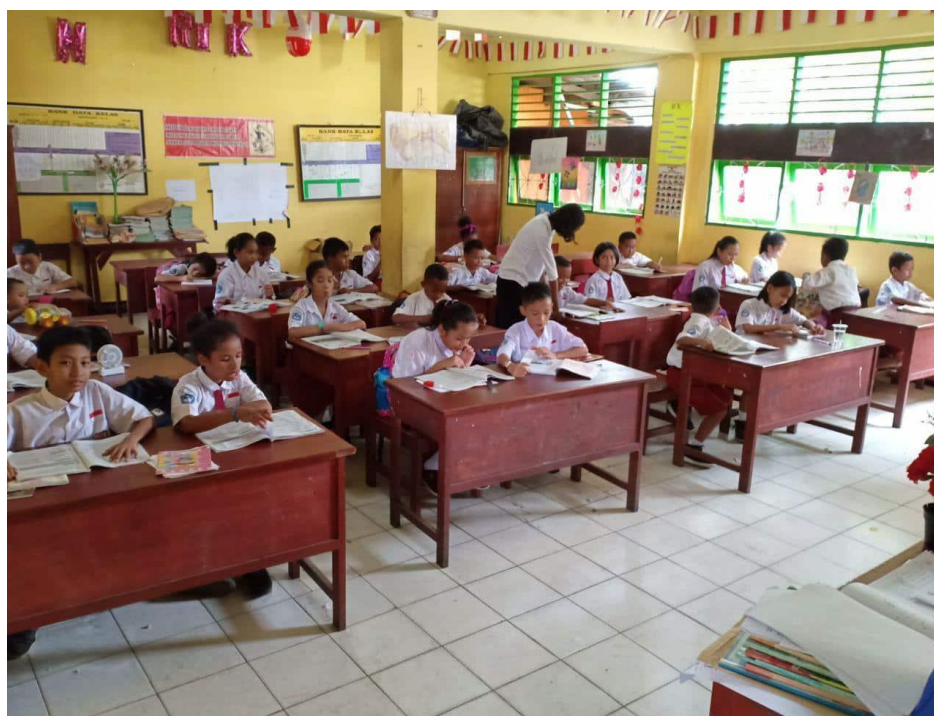
Figure 3. Children in in-person class

The Covid pandemic causes a fluctuating number death. Figure 2 shows that from 34 provinces in Indonesia, of 28,233 infected with COVID-19, around 1,698 died (6%) (Ministry of Health, 2020).