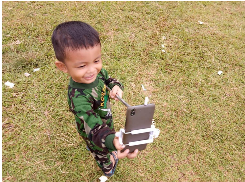
Figure 4. Child using gadget

Online learning or distance learning itself aims to meet of the use of information technology connecting students and teachers. Educators, parents and children change learning modes with various online methods such as Whatsapp application, Zoom Meeting, Google Classroom, Email, and other applications. As a result, time and space of using the gadgets or laptops are inevitable (Basilaia, G. & Kvavadze, D., 2020).