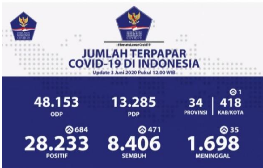
Figure 2. The number of positive COVID-19 cases in Indonesia as per June 3, 2020 at 12.00 AM WIB.

The Covid pandemic causes a fluctuating number death. Figure 2 shows that from 34 provinces in Indonesia, of 28,233 infected with COVID-19, around 1,698 died (6%) (Ministry of Health, 2020).