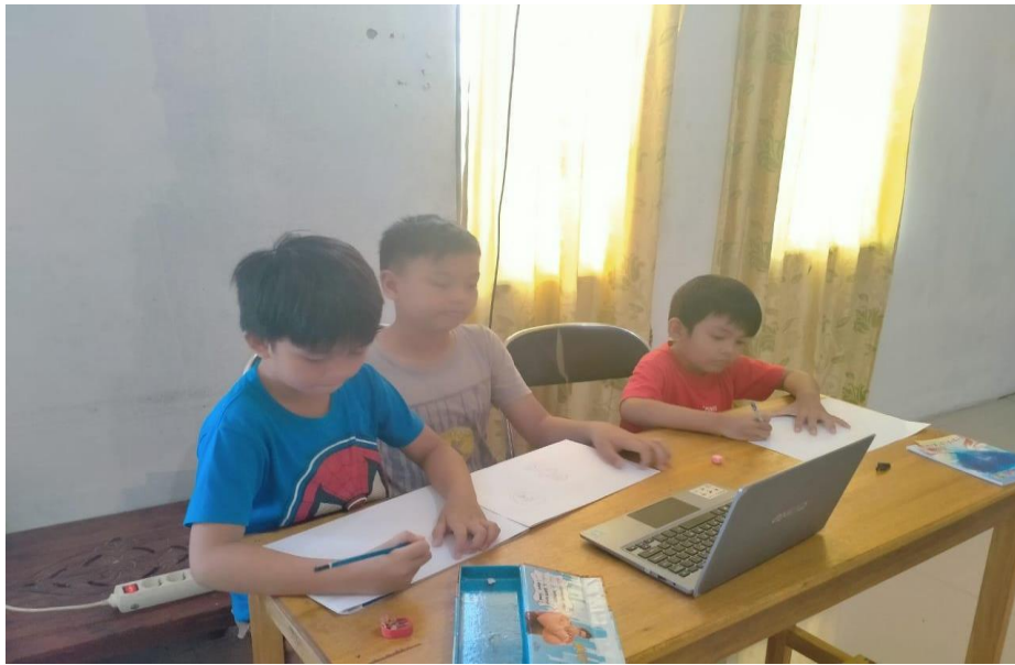
Figure 5. Online learning with siblings at home during the pandemic

Overcoming future impacts of online learningshould be our concern. According to Law No. 20 of 2003 concerning the National Education System, education is a conscious and planned effort to create a learning atmosphere and learning process so that students actively develop spirituality, self-control, personality, intelligence, noble character, and useful skills for themselves, the society, and nation. Recommendations such as studying with siblings may instill the spirit of learning and social sensitivity.