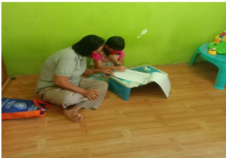
Figure 6. Parental assistance in online learning from home during the pandemic

Overcoming future impacts of online learningshould be our concern. According to Law No. 20 of 2003 concerning the National Education System, education is a conscious and planned effort to create a learning atmosphere and learning process so that students actively develop spirituality, self-control, personality, intelligence, noble character, and useful skills for themselves, the society, and nation. Recommendations such as studying with siblings may instill the spirit of learning and social sensitivity.