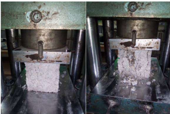
Fig. 1. A cubic specimen before and after testing in UTM