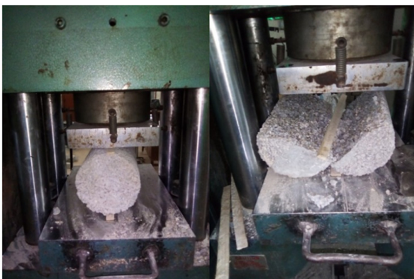
Fig. 2. A cylinder specimen before and after testing in UTM