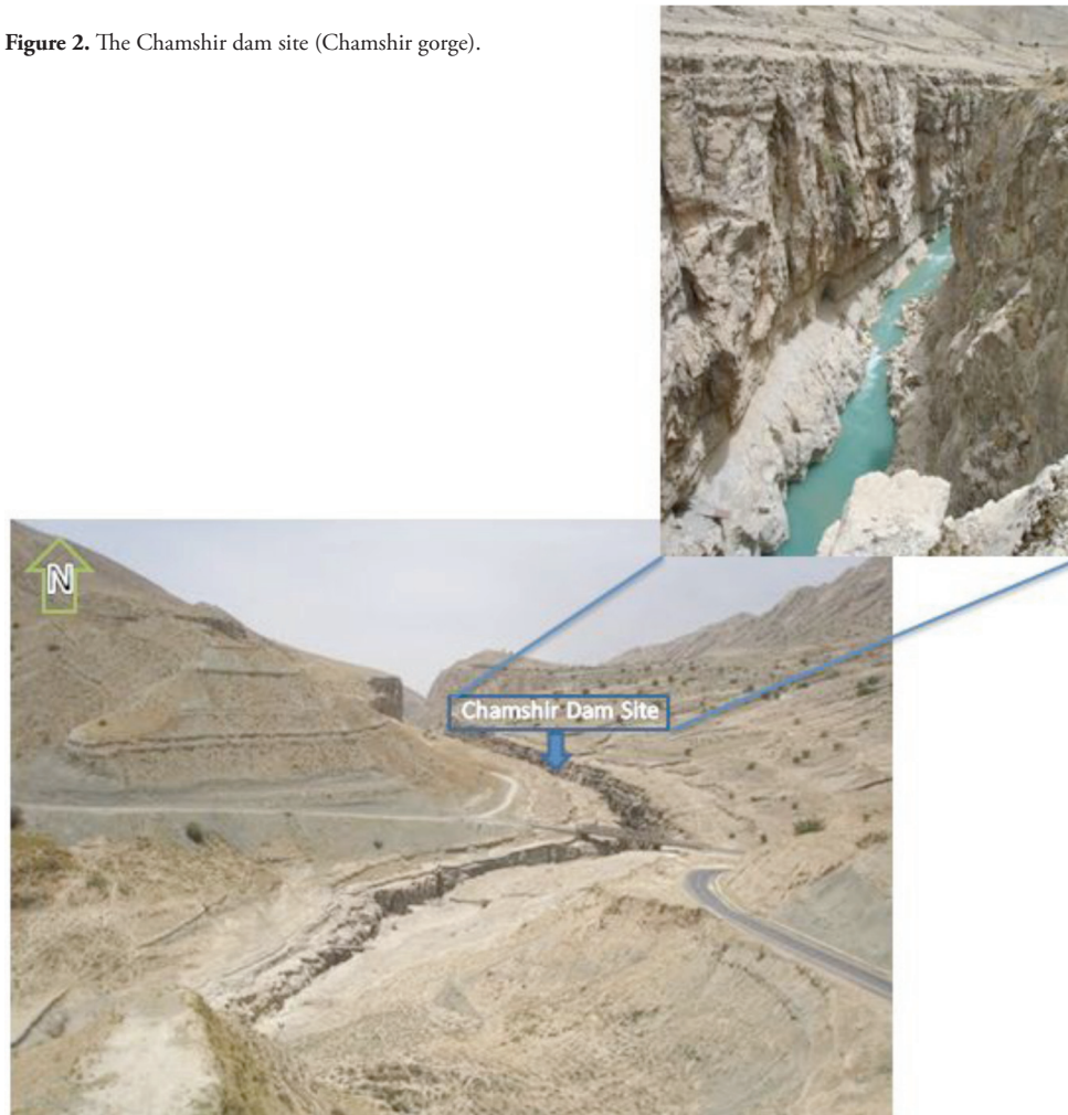
Figure 2. The Chamshir dam site (Chamshir gorge).

258m thick, having alternating layers of anhydrite (or gypsum), salt, red marl and limestone. The seventh member is the youngest member, being 139m thick and having alternating gypsum, gray marl and limestone layers. It should be mentioned that sulphate layers outcrop as gypsum on the surface and as anhydrite at deeper levels. The Gachsaran formation covers most parts of the projected dam reservoir (Figure 1). According to field observations, members 5, 6 and 7 of the Gachsaran formation would be in contact with the dam reservoir in this area and only member 7 outcrops downstream of the dam. The Aghajari formation would form a small part of the reservoir at its south-western corner and consists of sandstone, siltstone, conglomerate, gypsum and marl. Young and old terraces are also present along the banks of the Zuhreh river (Figure 1), consisting of coarse grained gypsum particles and fine grained silt and sand sediment.