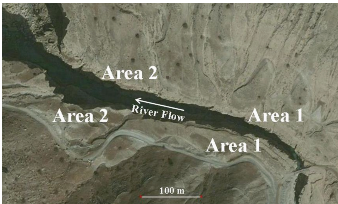
Figure 3. Satellite image of Chamshir dam site ( http://www.google.com/earth/index.html ).