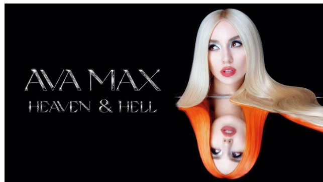
Figure 1. Cover of Ava Max's Heaven & Hell album

Overall, current linguistic exploration of songs is dominantly about identifying figurative language, slangs and word formation processes. Considering the prolific nature of studies on slangs in songs, especially on the word formation processes, further replication might not be able to offer anything new. However, this study still finds value in conducting this study. Upon observing the wide range of data, namely the many different songs that have been studied, this study noted that previous findings were born from small numbers of slang data, ranging from roughly 50 to 150 examples. This study would like to replicate the study of slangs in songs by extending the sample data beyond 200.