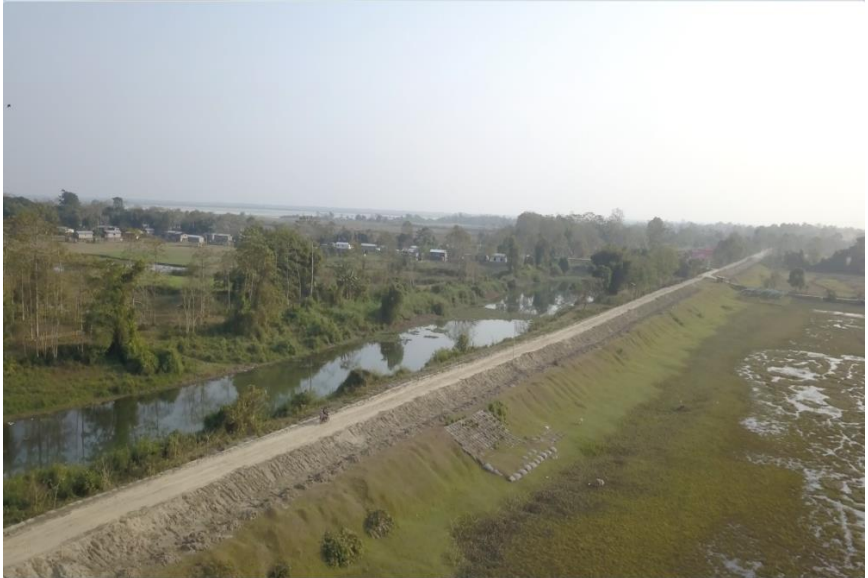
Figure 2: Drone Footage of a Section of an Embankment in Salmora, Majuli

[T]he millions of acres of culturable land now lying waste represent millions of rupees which might be dug out of the soil but are now allowed to lie useless like the talent wrapped in a napkin (Cotton 1897, cited in Saikia 2013, 11).