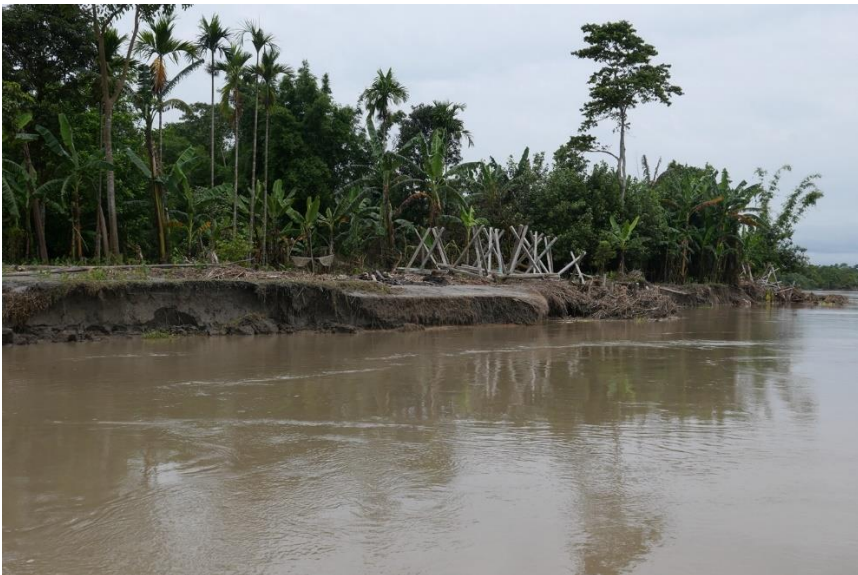
Figure 4: Riverbank Erosion Ravaging Part of Salmora Village in Majuli

the more prosperous part of the island. It has some of the more productive agricultural lands, particularly suitable for paddy cultivation, and it also has a significant share of the island's wetlands. The countryside is also the business and administrative hub of the island. The riverside area is relatively less prosperous and has poorer infrastructure. It is also densely populated, with a predominance of the missing community. This region also includes the chaporis , that is, the more ephemeral parts of Majuli. Far from preventing floods and erosion, the embankments have rendered both these spaces much more vulnerable than before, and in distinct ways.