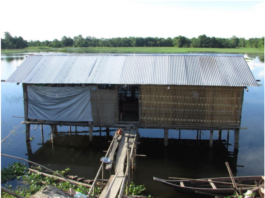
Figure 5: Flood as an Everyday Phenomenon in Areas Outside Embankments

embankments, the fields in the countryside are now deprived of annual alluvium ( polosh ) that floodwater used to bring in earlier. It is not surprising that the farmers in the countryside are increasingly applying chemical fertilizers and pesticides in their fields, with potentially dangerous implications in the long run.