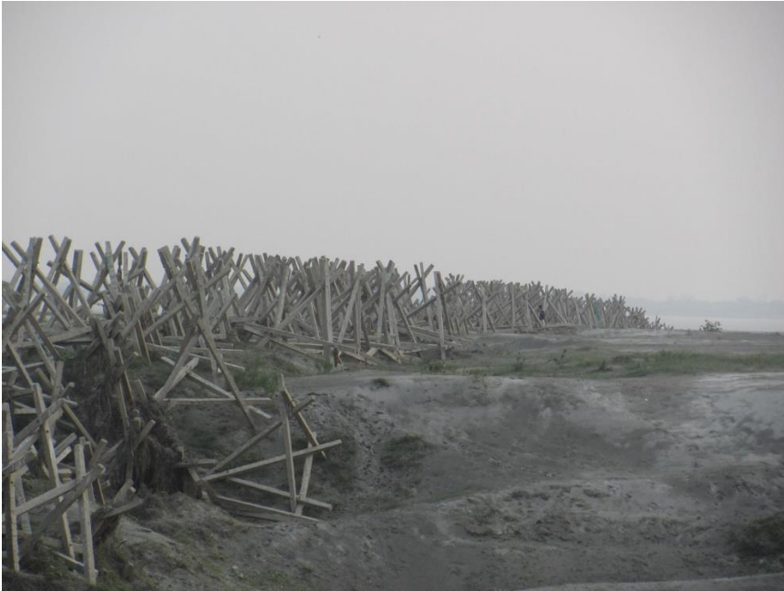
Figure 7: RCC Porcupines in the River near Dakhinpat Village, Majuli

neighbouring villages. 10 Because of these risks, some people in the riverside villages referred to the spurs as “ mrityubaan ” (weapons of death). Not only are the spurs unlikely to protect the island from erosion, but they may also render the downstream areas as well as the riverbanks on the other side much more susceptible to erosion, since the river now hits these places with far greater force.