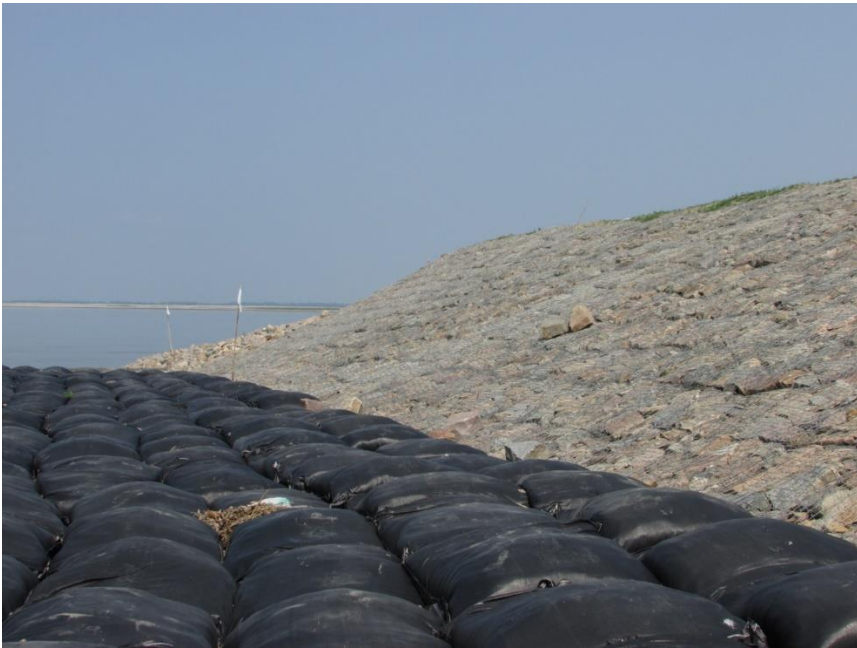
Figure 6: A Boulder Spur in Sumoimari Village, Majuli

We are victims of the embankment in multiple ways. Unlike the bhitor anchal , our areas are flooded every year, and for a longer duration. Being a nadi-kaxoriya gaon (riverside village), people in our village own very little land, which, too, is often inundated and not suitable for agriculture. [...] Much more upsetting to me is the fact that we now have to live with these huge ponds right in front of our houses, which were dug for the purpose of building and repairing the embankment. In the monsoon, these ponds usually overflow, and the entire area becomes like a drain. At that time, we can't even access the road and it is a particularly dangerous situation for our kids. Basically, we are squeezed between the river and a drain.