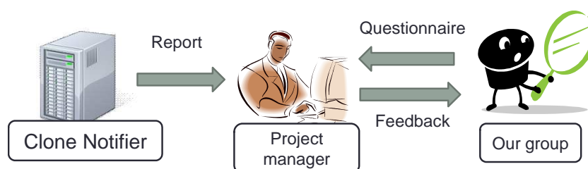
Figure 2: An Overview of the Case Study