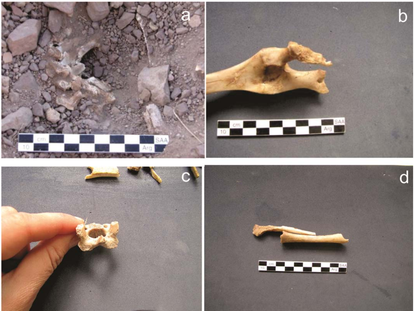
Figure 2. Different post-depositional damage. a & b: carnivore gnawing in context A; c & d: rodent gnawing in context B.

data on bone modification that occurs in the first three months after deposition of skeletal remains. This actualistic study is useful because it allows detection of differences and similarities in how taphonomic processes affect skeletal remains in the two different contexts, an open-air site and a cave, within the same physiographic region.