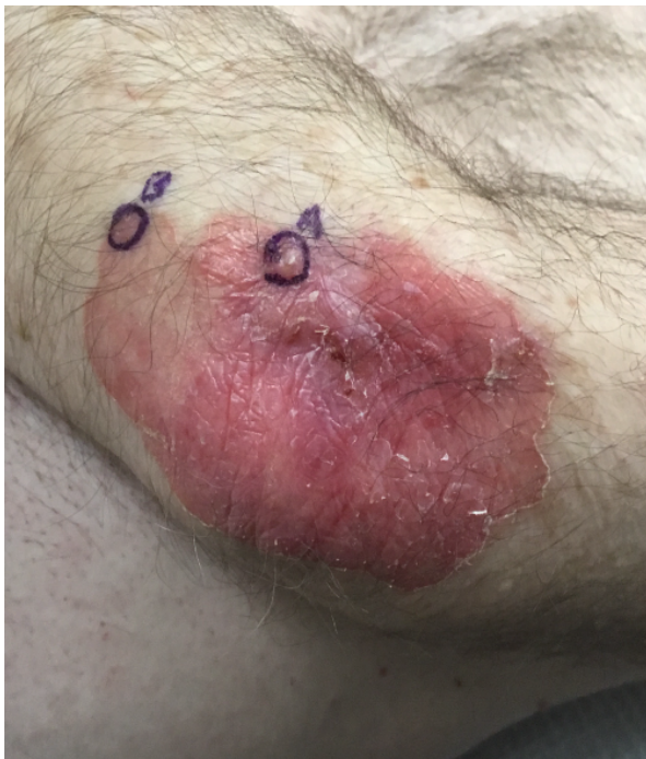
Figure 2: 2022: An erythematous, scaly plaque on the left elbow with a hyperkeratotic border exhibiting a new, discrete papule crust. Locations A and B were biopsied and revealed SCC and GPK, respectively.