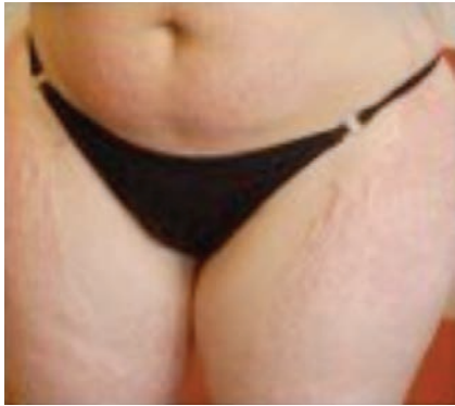
Figure 1. Erythematous papules and urticarial plaques with periumbilical sparing and accentuation in striae in a 21-year old woman with polymorphic eruption of pregnancy.