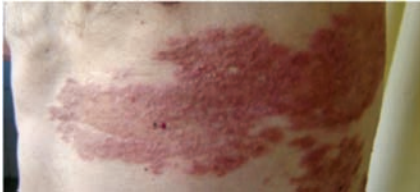
Figure 1. Clinical presentation with zosteriform pattern distribution.