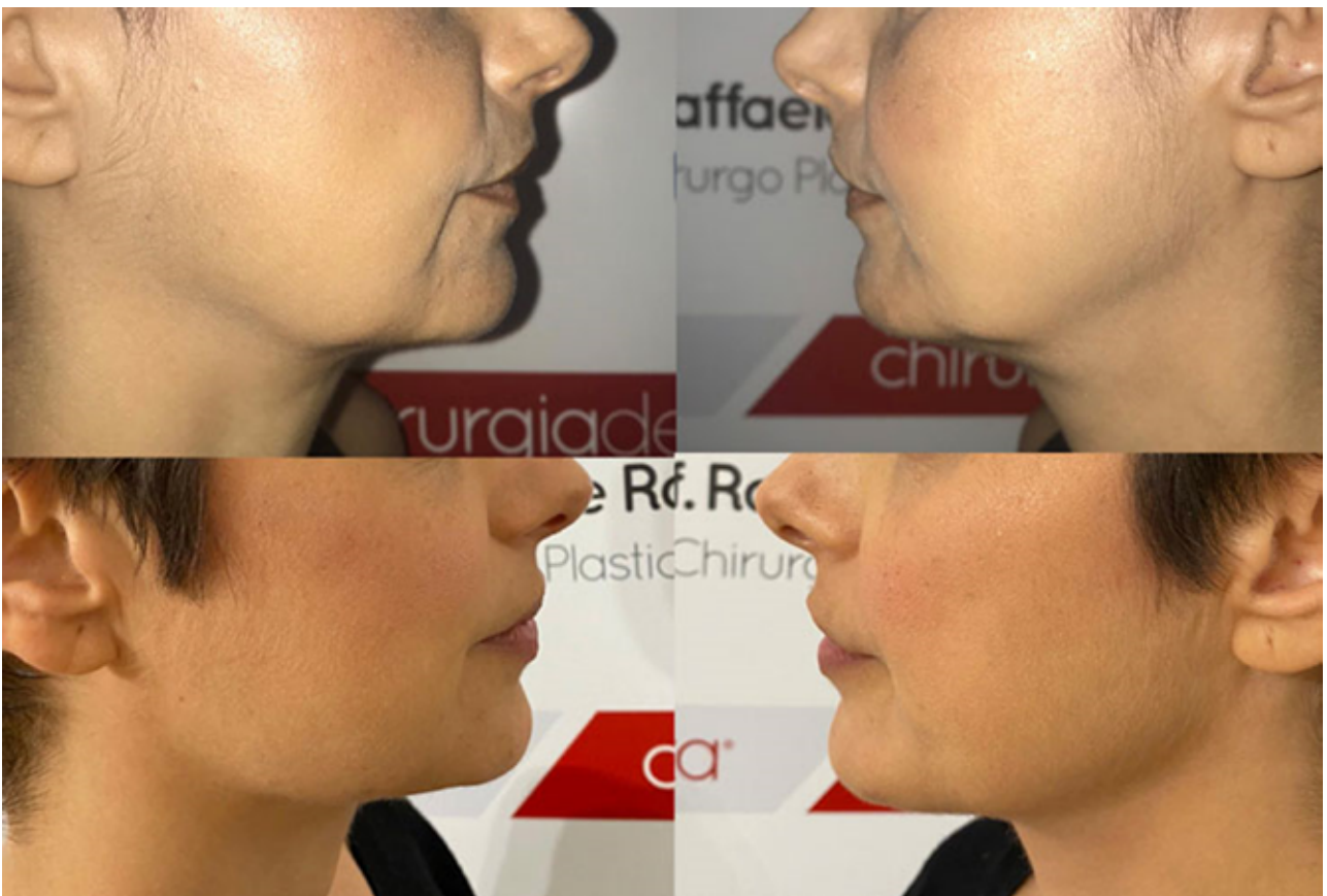
Figure 8. Three-quarter view of a 46 year old patient before (upper part) and 3 months after the injections (lower part).