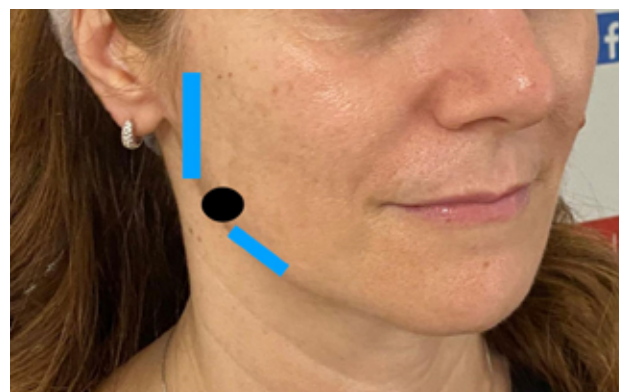
Figure 1. The black dot indicates the area to be filled with deep injections over the periosteum, with a high G' filler. The blue lines indicate the area to be filled subcutaneously with a hyaluronic acid filler with a G' ranging between 200 and 300 Pa.

Thirty-six consecutive patients seeking nonsurgical reshaping of the jaw-line were examined and treated. Every patient was female, age ranging from 42 to 71 years (mean 45.7 years). Minimum follow-up was 3 months, maximum 2 years. A minimum of 4 and up to 7 vials of HA filler was injected to achieve the desired results. Early or tardive adverse events were not reported. A moderate reduction of lower teeth display was recorded in all the patients. However, this issue was clearly explained to the patients before the injections (Figure 2). Patient satisfaction assessment results reported no scores lower than 75. Twelve patients gave a score of 100, 8 patients rated 90, 12 patients indicated a score of 85, 4 patients rated 80, and 2 indicated 75 (Table 2). Whenever the procedure was carried out with fillers not containing a local anesthetic, patients reported more pain and discomfort than patients who received fillers premixed with a local anesthetic.