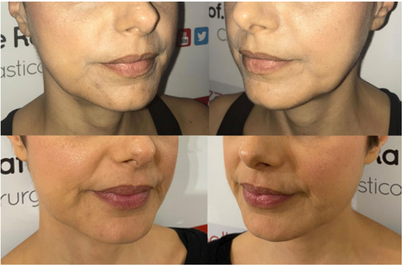
Figure 7. Three-quarter view of a 46-year-old patient before (above) and 3 months after the injections (below).