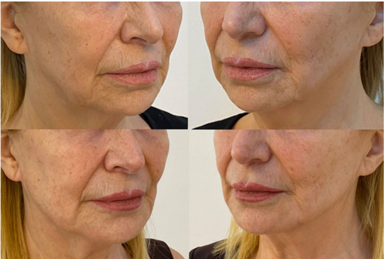
Figure 4. Three-quarter view of a 68-year-old patient before (above) and 1 month after the injections (below).