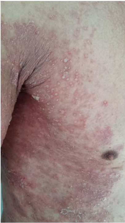
Figure 1. Vesiculo-pustular lesions mostly on well-circumscribed erythematous patches on the axillae.