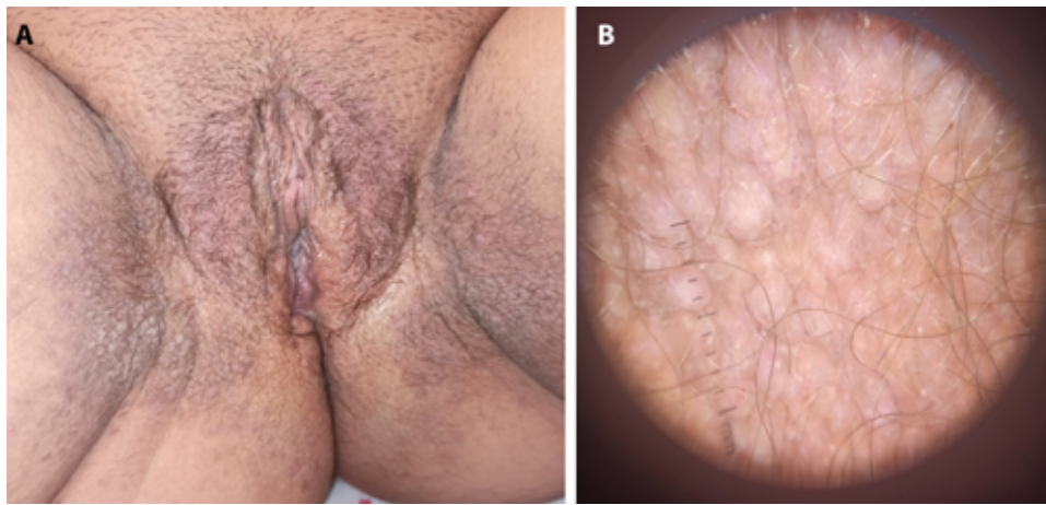
Figure 1. (a) Multiple shiny whitish papules 2 mm to 3 mm in diameter in a cobblestone pattern on the medial aspect of the thigh, on the perineum, and in the perianal region. (b) Dermoscopic image showing brown pigmentation and globular domed brown papules.