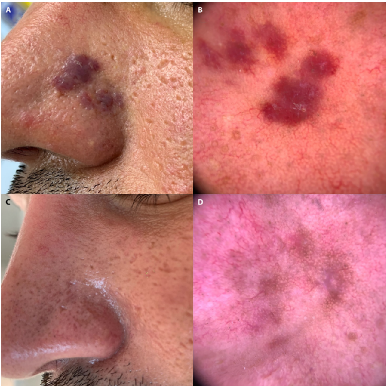
Figure 1. (A) Exam revealed papules and red-purple nodules, grouped and well delimited on the left side of the nose. (B) Dermoscopy showing oval bright red areas and globular structures, with grayish background. Arborizing telangiectasias are present in the periphery. (C) Exam after 3 months of treatment evidenced normal aspect of the skin. (D) Dermoscopy after treatment showed complete disappearance of vascular structures. Only discrete pseudo-red pigment and some arborizing telangiectasias remains.