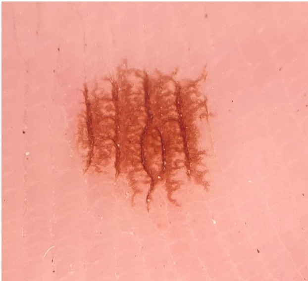
Figure 2. Streaks of orange-brown pigment with ridge enhancement on dermoscopy (DermLite DL2 Hybrid, x 10).