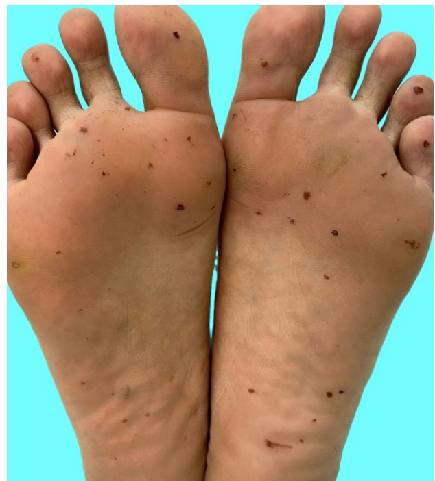
Figure 1. Multiple non-blanchable and non-tender brown-black macules over soles.

Pigmented macules have been previously reported in India due to burrower bug Chilocoris spp (family, Cydnidae ; super-