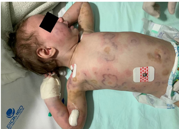
Figure 2. Diffuse arcuate and annular pink edematous plaques with central purple annular patches surrounding a yellowish center.

On the first day of hospitalization leukocytosis was at 24.730/\text{mm}^3 , after 2 days it raised to 31.800/\text{mm}^3 ; C reactive protein analysis increased from 29,9\text{mg/dL} on the first day, to 90,2\text{ mg/dL} . Liver enzymes and renal function were normal. Transthoracic echocardiogram did not demonstrate any abnormality.