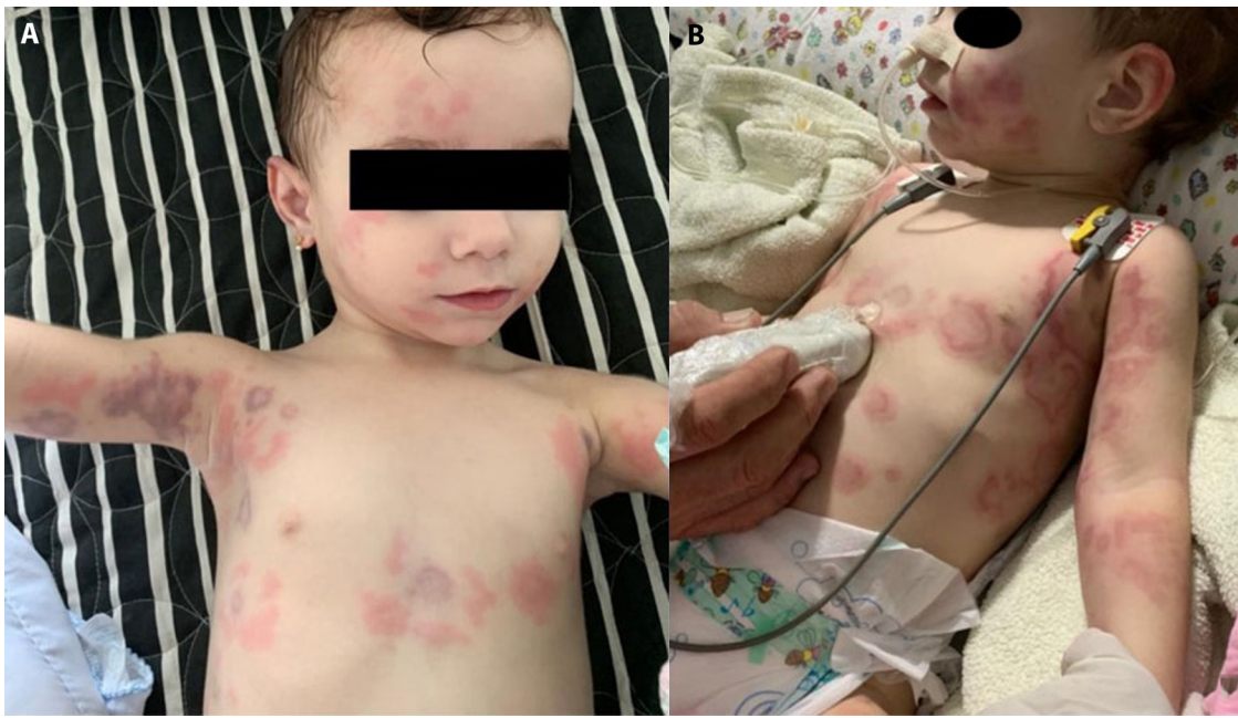
Figure 1. (A) Diffuse erythematous and violaceous, edematous plaques on trunk, axillary region, and face. (B) After 2 days, appearance internal violaceous halo.