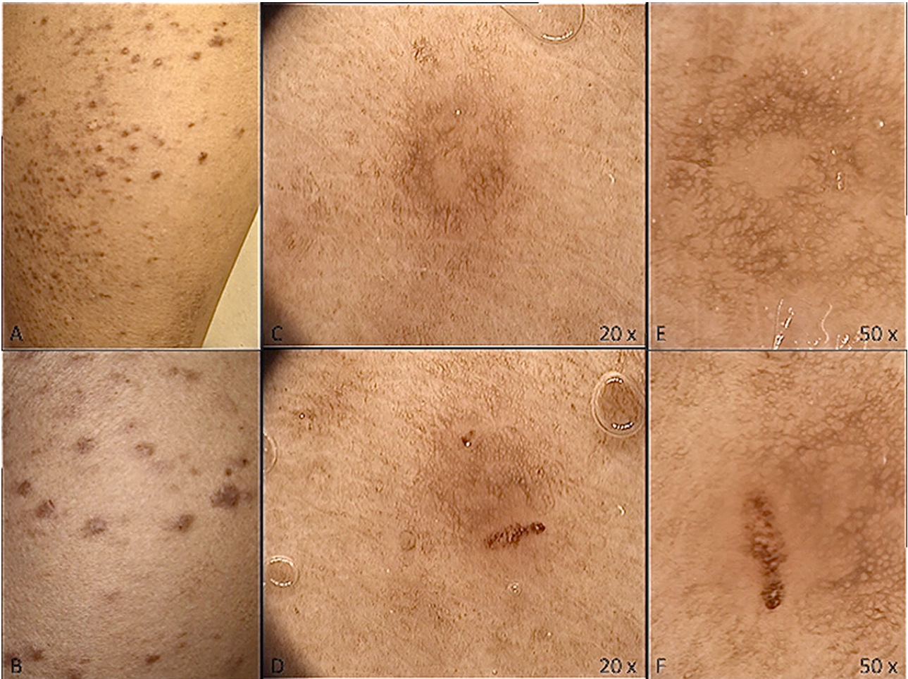
Figure 1. (A, B) Hyperpigmented papules located on the left lower limb with zosteriform distribution. (C, E) The dermoscopic pattern is similar to that described in dermatofibroma without featureless central hypopigmented area and thin peripheral pigmented network. (D, F) In addition, a hyperpigmented, elongated structure with an ill-defined dermoscopic pattern can also be seen in some of the cases.

from the erector pili muscle of hair follicles (piloileiomyomas); those originating from the vascular smooth muscle (angioleiomyomas); and those arising from the smooth muscle of genital skin (dartoic leiomyomas) [1,2].