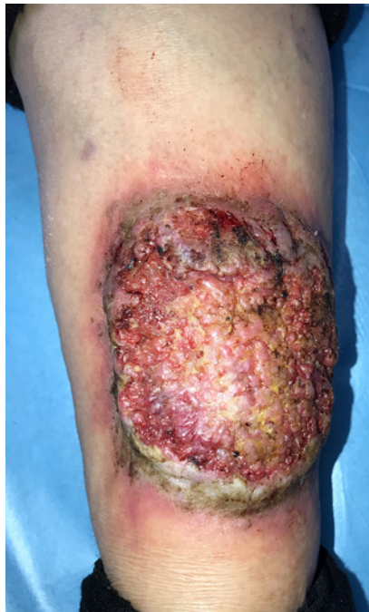
Figure 1. Vegetative ulceration 18 × 10 cm in size on anterior aspect of the left leg.