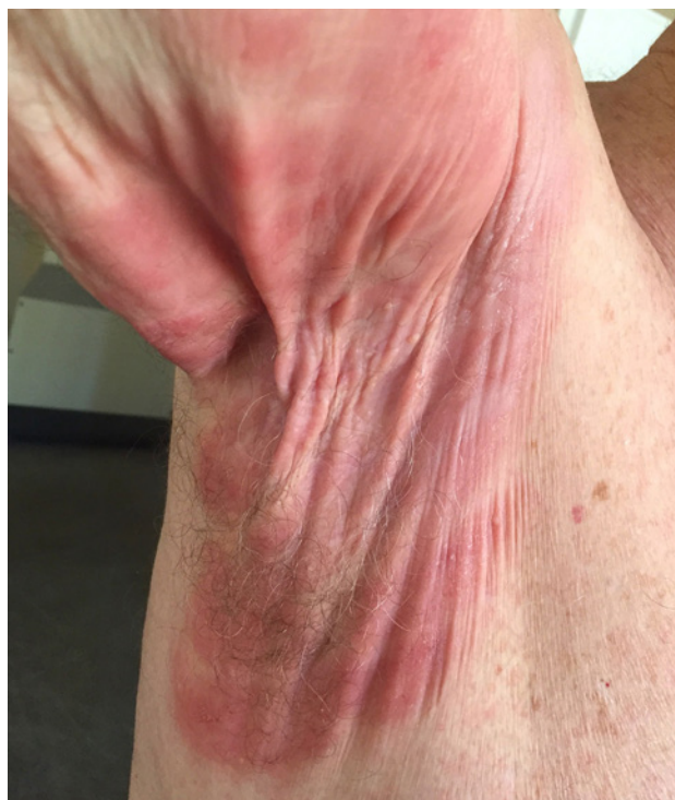
Figure 1. A well-circumscribed erythematous plaque, consisting of pendulous, wrinkled, lax skin, occupying the axilla is typical of granulomatous slack skin.