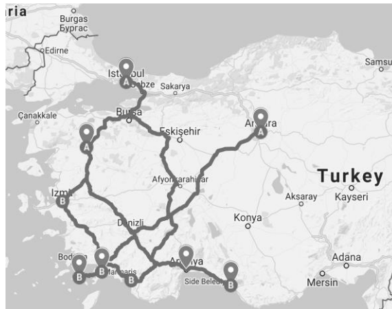
Figure 1. The route charts

The company that provides passenger highway transportation by bus has the operation centers that coordinate and perform passenger transport operations in different settlement locations. These centers independently give their trip decisions related to their operations, can put new trips and cancel or take out the existing trip. A trip is the name of bus passenger transport from a settlement point (a location, called the origin) that will be travelled from at a certain time (the departure time) to another settlement point (the destination) at a certain time. When a bus completes this process, it waits until the most suitable departure time to move on to the target settlement point at this settlement point. This waiting period is called idle time. Figure 1 shows the route charts of one of the operation centers of the company on the map during the research period. The idle times between the trips are given in Table 1 and are expressed in minutes. Table 3 shows how these values are calculated.