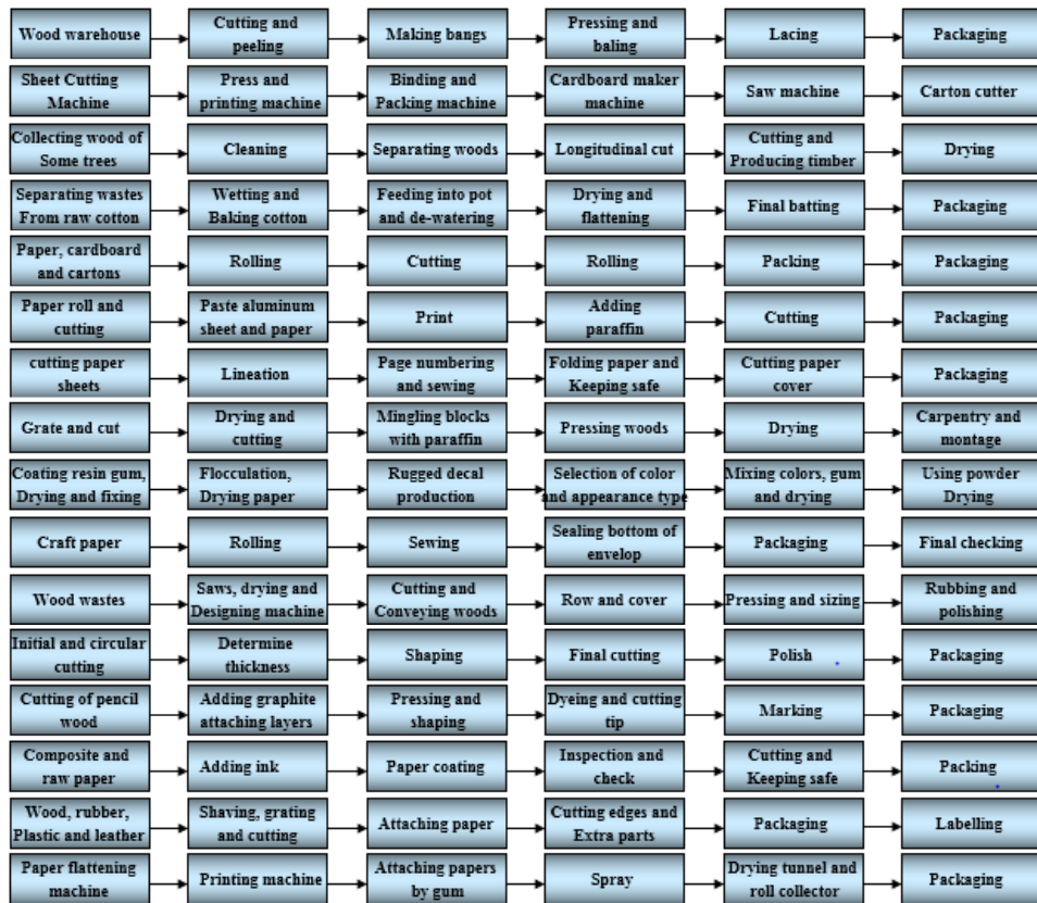
Up to down: Cooler bangs (1), Carton (2), Industrial drying wood (3), Hydrophilic cotton (4), Sheet rolls and packing (5), Wax paper (6), Booklet (7), Hasp (8), Decal (9), Multilayer paper bags (10), Row board (11), Wooden and paper disposable products (12), Wooden pencil (13), Carbon paper (14), Parquet (15), Sandpaper (16)

carpentry, shoemaking, coiling, carving and railway wagoning, and many other industries, especially in the motherboard industry. Today, many products, such as a variety of compact fibres, bone fragments, chipboard, refractory boards, triplex and five-ply boards, and many others are used in machine systems, building and refurbishment work etc. Therefore, we tried to present wood applications and existing technologies to produce and make woody equipment. Our data were raw results of Iranian evaluator team once before construction of manufacturers in terms of energy consumed, input and output materials injected into generation process along with accessible facilities in each industry. Figure 2 shows the IWCI and their production processes and running technologies. Table 3 includes input materials entered to IWCI and Table 4 contains IWCI, number of staff, land area used and energy consumptions.