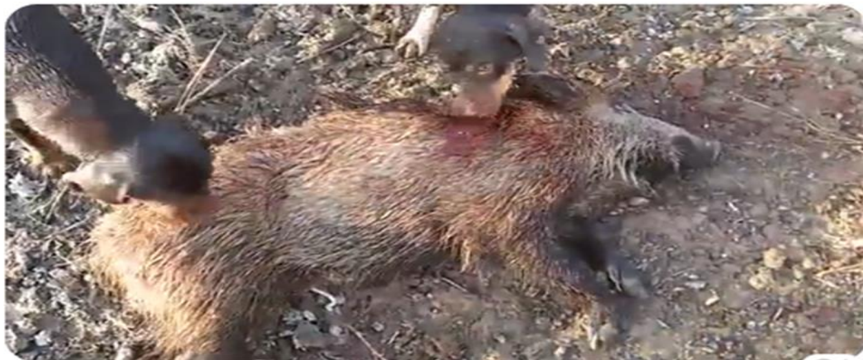
Figure 1. A hunted wild boar in Al-Mugdadia, Diyala province. Two dogs attacked the killed boar

The study was carried out from August 2016 to November 2017. Blood samples were collected from 51 cows, 34 sheep and 15 killed wild boars of different ages (Figure 1 and 2). Furthermore, tissue samples from lymph nodes, tonsils and trigeminal ganglion of 15 killed boars were collected, labeled and kept in -30 °C until use. These animals were distributed in different villages of different local towns of Diyala province and Al-Rahmania village of Al-Suwairah town of Wasit province (Table 1). 10 ml of blood from each animal were collected from Jugular vein using 5 ml size EDTA glass tubes.