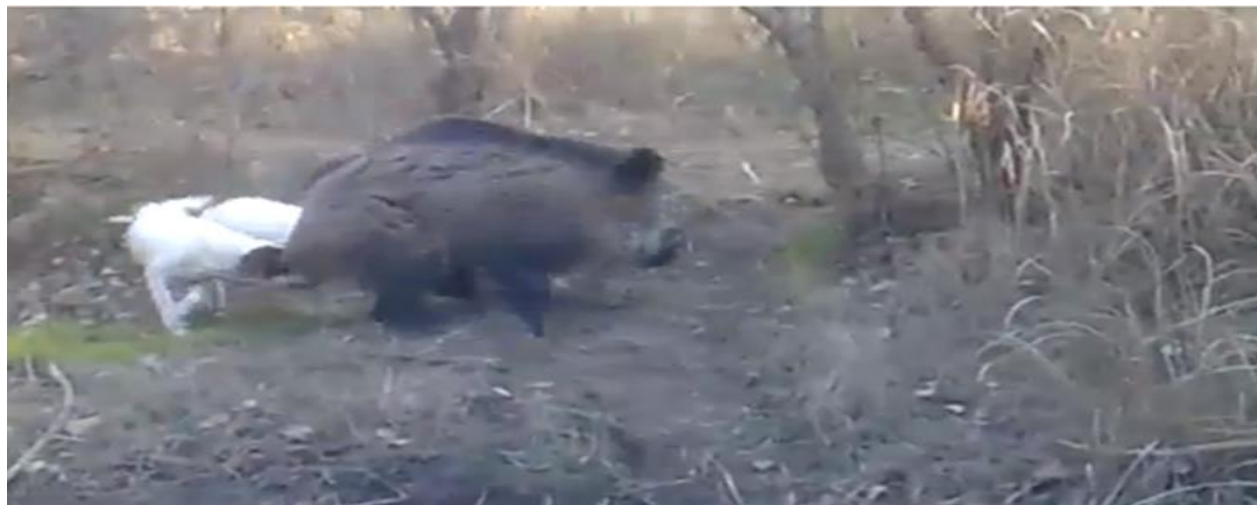
Figure 2. Live wild boar at the time of hunting. It was attacked by two white dogs at Al-Mugdadia, Diyala province