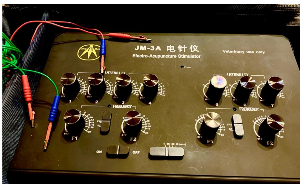
Figure 1. Electro-Acupuncture Stimulator JM-3A by Dr. Xie Huisheng