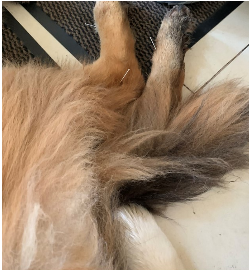
Figure 2. Rufus during the treatment: LIV3 (bilaterally), KID3.