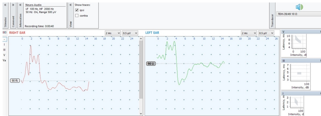
Fig. 4 Motion artifact

To avoid motion artifacts, sedation of the patient is recommended.