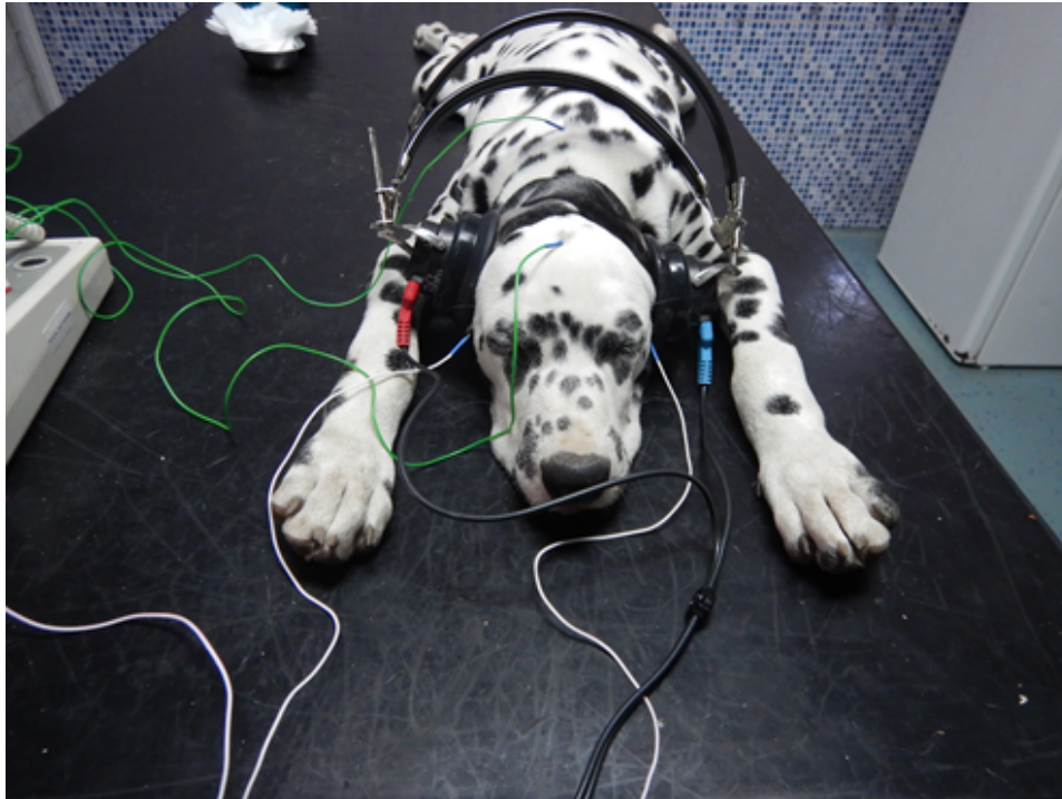
Fig. 1 Positioning of headphones in BAER test