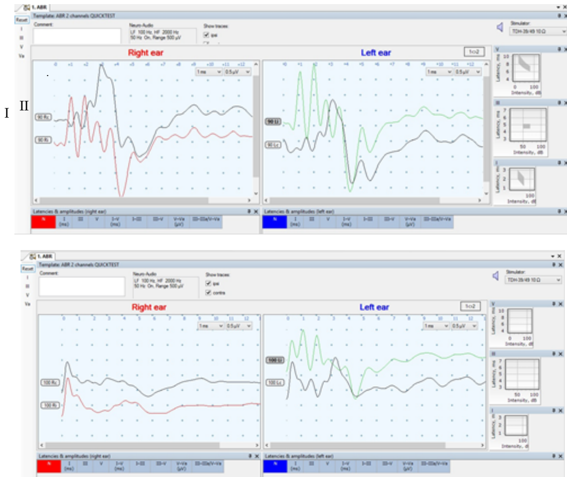
Fig. 2 Right ear deafness.