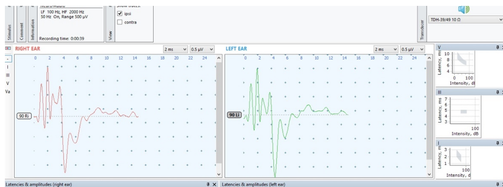
Fig. 5. Same patient after sedation.