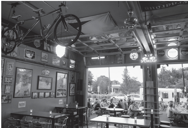
Apex offers a huge outdoor patio and an extensive beer list.

Townshend's Teahouse offers stellar tea selection and kombucha on tap, and Random Order Coffeehouse has a devoted following for its homemade pie and tasty cocktails.