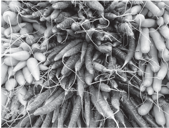
Lush farmland and seasonal produce drive the sustainable, locavore restaurant movement in Portland.