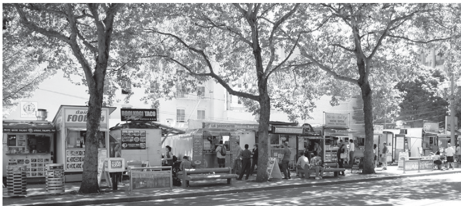
Portland's food carts fill whole city blocks, like this one downtown.

might steal the show. Luc Lac serves up great Vietnamese dishes with a hip, Portland vibe—the cocktail list, funky decor,