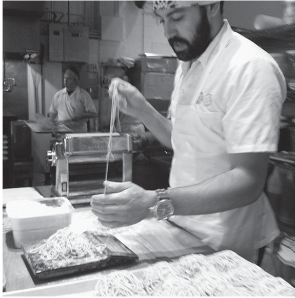
Handmade ramen noodles at Boke Bowl.

Taqueria . Head over to Lovely's Fifty-fifty for some of the city's best wood-fired pizza. Grab a seat at the huge patio for great food,