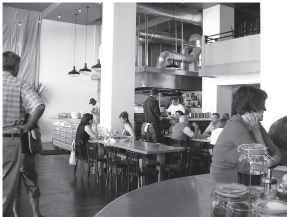
Communal tables and open space of Clyde Common.

like Pok Pok , Ava Gene's , and the Woodsman Tavern have received national recognition and a dedicated following. Plenty of cheaper and quicker options are available without the reservation or lines. Try Bollywood Theater for fresh and original Indian street food,