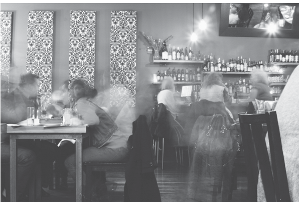
Toro Bravo Spanish Tapas.

The Blossoming Lotus serves some of the best upscale vegan food and cocktails in town. The 15th Avenue Hophouse features sampler trays of their extensive local craft beer tap list. Milo's City Cafe is a popular destination for neighborhood locals.