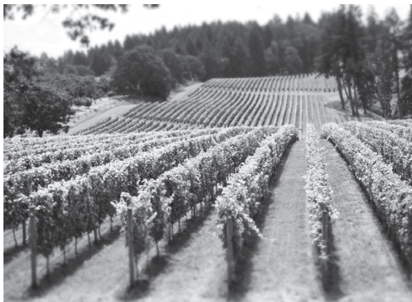
Lush Willamette Valley Vineyards.

list. The immensely popular tapas restaurant Toro Bravo serves memorable small plates of Spanish fare. If there's a wait, pop upstairs for amazing cocktails at the intimate hideaway Secret Society Lounge .