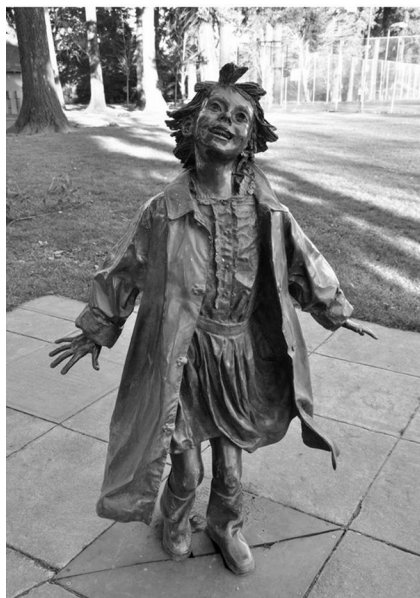
The Ramona Quimby statue in Portland's Grant Park.

Powell's Books. Portland also has a wonderful zoo, museums galore, and much, much more. See you in 2015! ♪♪