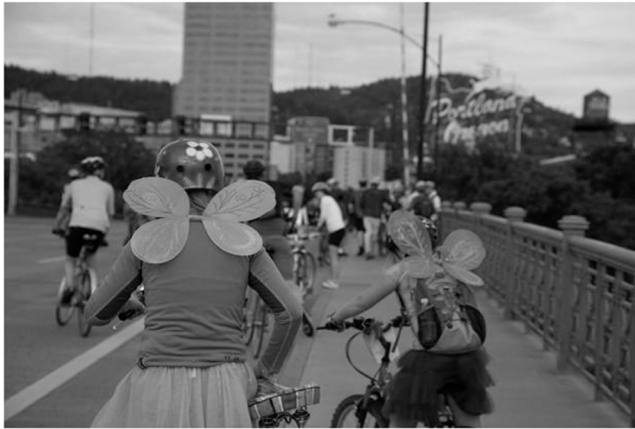
Portland Bridge Pedal.

Among Portland's many nicknames is "Beer-vana." We definitely earn that one. We have a lot of beer and brewpubs; at the time of this writing, there are 53 breweries in Portland, more than any other city in the world. To recover from the beer, we drink coffee. The coffee keeps us