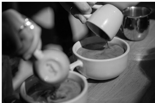
Portland Coffee.

The 1930s to 1950s brought about a lot of dam building in the Columbia Basin. This led to cheap electricity, but also had some negative unintended consequences, including greatly reduced salmon runs and sturgeon populations. Gone are the days when fishermen would line the downtown bridges shoulder to shoulder to catch some of the millions of fish that made their way home. But the cheap power spurred the increase of ship-building at the start of World War II, which drew more Af-