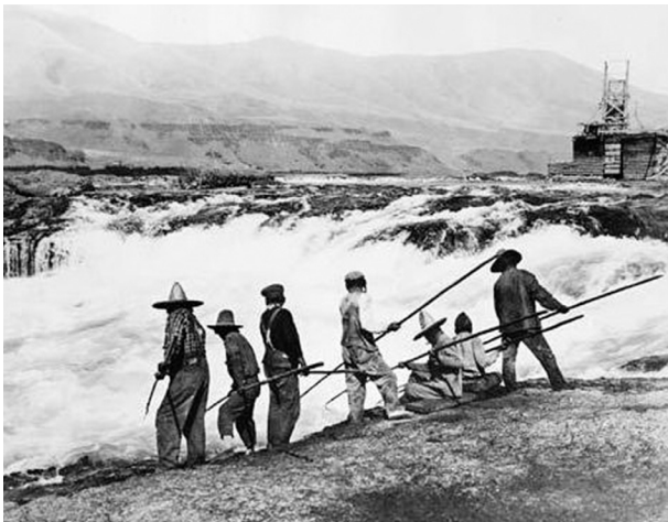
Native Americans spearing fish at Celilo Falls with fishwheel in background, c.1905, www.ohs.org/education/oregonhistory/historicviewer/CeliloFalls/celiloFalls1905.html .

Washington and Oregon, carving the Columbia River Gorge, which ends (or begins) a few miles east of Portland. These floods cut a canyon through the Cascade range, and created the waterfalls that give the mountain chain its name. At their deepest, these floods put 400 feet of water on top of what is now downtown Portland.