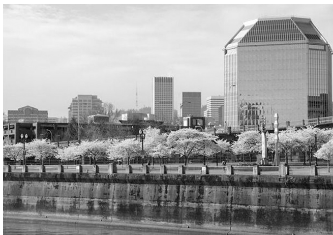
Cherry trees in bloom in Waterfront Park.

gathered beaver skins for the European trade and sea otters for the Chinese market. Some of these men later left the fur trade and set up farms in the Willamette Valley. Around 1840, the farmers started meeting in Champoeg (pronounced “shampoo-ee”) to discuss ways to solve problems, in particular wolves eating their livestock. A few years later, the question of whether the United States or England should be the governing force over the Oregon Country came up. The former traders met and voted to go with England, 52-50. Then, a pro-American in the group reminded two of the men who had voted to be under English rule that they had English arrest warrants out for them. The vote was retaken, and the United States carried the day. Champoeg was leveled by a flood in 1861 (save for two saloons), and the site, about 15 miles south of Portland, is now a lovely state park.