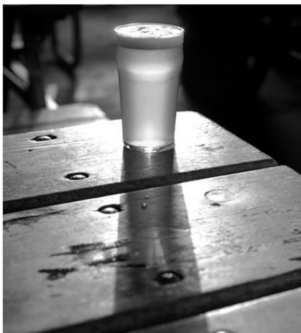
Portland microbrew.

About the same time, Republican governor Oswald West realized that the pattern of wealthy individuals buying up oceanside property in the east was soon to come to Oregon. He approached the legislature with a plan to declare all beaches “public highways.” The idea of a free road system appealed to them, and the plan was approved; all beaches in