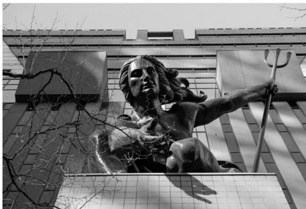
Portlandia statue.