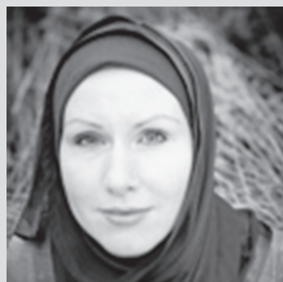
G. Willow Wilson

Opening Keynote Session, March 25, 2015: G. Willow Wilson, comics writer,