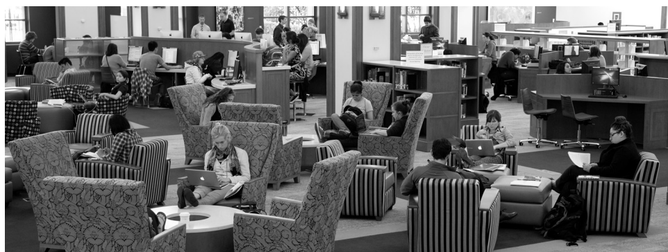
The new Richardson Library Information Commons.