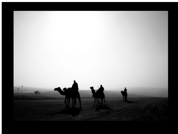
Camels in the UAE desert. Image used on question card for: “I forgot my laptop and I need one for class. What do I do?” Image by Diana Chester.

the Washington Square Arch. Each image was paired with a question prompt related to library services, spaces, and collections, which were interspersed among students in the audience. For example, when a photo of the Brooklyn Bridge is projected on the screen, the student with that image asks the question written on that card, which might be: “How many books can I check out?” or “Can