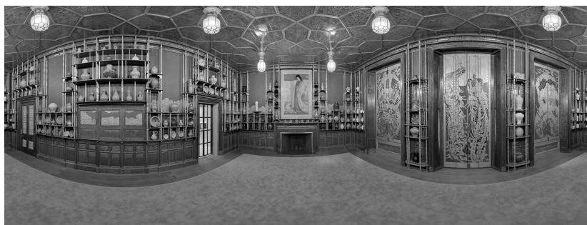
Image of Whistler's Peacock Room.

Wayne State University and the Smithsonian's Freer Gallery of Art recently announced the launch of a new online resource, The Story of the Beautiful: Freer, Whistler, and Their Points of Contact , a comprehensive guide to James McNeill Whistler's Peacock Room and