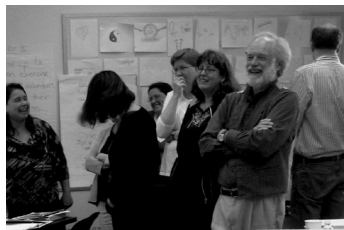
Participants at a 2012 Immersion program

ACRL endeavors to improve members' ability to teach and assess lifelong learning skills. To help librarians and institutions develop and implement information literacy programs on their campuses, the ACRL Institute for Information Literacy's Immersion Program offered three Immersion programs in FY12, including the first institution-specific program licensed to Cornell University. The Cornell Immersion curriculum was customized for this program and included parts of Teacher, Program, and Assessment track curriculum. Sixty-four individuals participated in the Assessment and Intentional Teaching tracks in Nashville, November 16–20, 2011. Ninety individuals attended the Teacher and Program tracks offered at Champlain College, July 22–28, 2012.