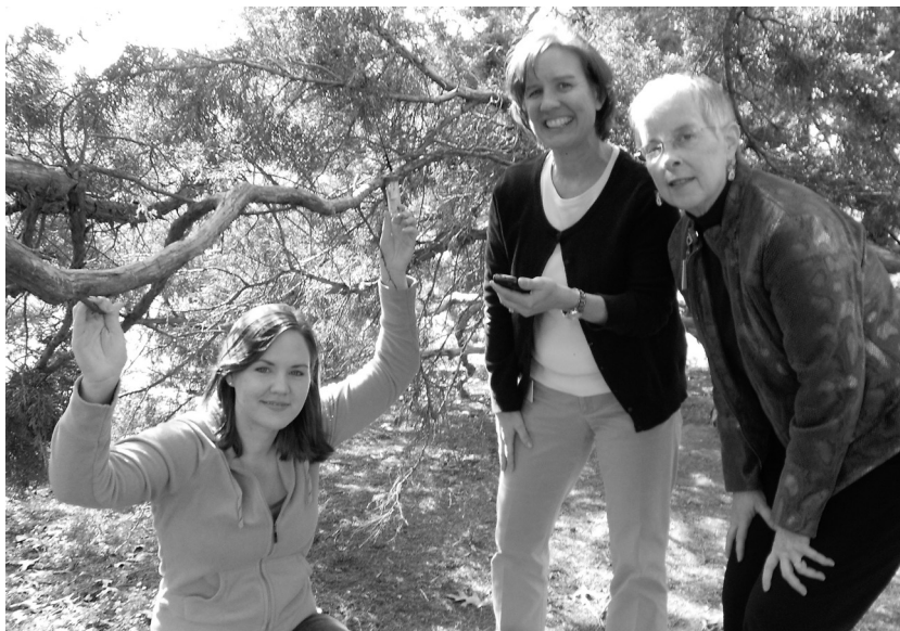
Schusterman Library employees find one of the geocaches hidden throughout the OU-Tulsa campus. A geocaching scavenger hunt was one of the activities included in the library's Find Your Place event series.

As with the letterboxes, caches were hidden around the campus in preparation for