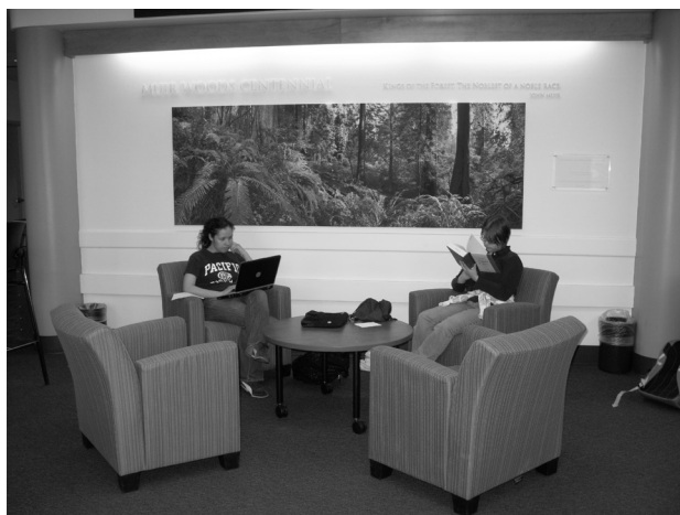
The Muir Woods image offers an artistic focal point for the Study Commons area of the University Library.

In order to make explicit the connections between the photograph and the John Muir Papers, the library mounted a 5-by-3-foot poster in an adjacent area of the Study Commons that highlights the Muir Papers and their significance. The poster explains how the papers embody Muir’s legacy and are used in research by scholars from around the world as well as Pacific students. It features images of items from the collection, such as letters, journals, drawings, and photographs, including a photo taken of Muir in Muir Woods. Together, the photographic mural and the poster give context to each other as decorations with both artistic and educational impacts.