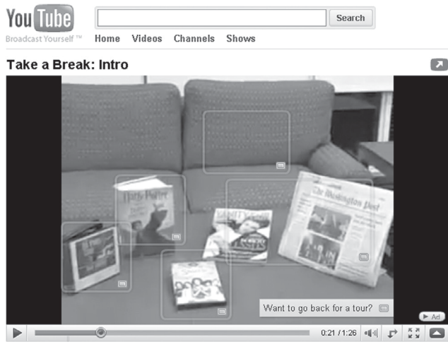
Take a break at the library.

The premiere of the video library, as well as the announcement of the contest winners, occurred at an event during the university's week-long celebration of undergraduate research in