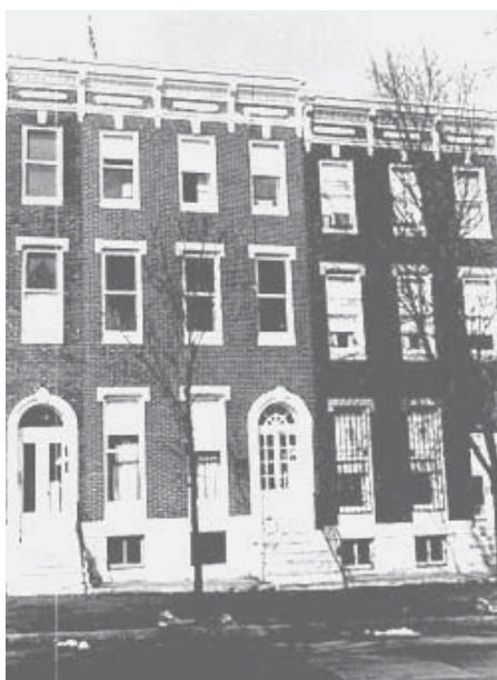
H. L. Mencken's House.

Alice McDermott, winner of the National Book Award for Charming Billy and author of the current bestseller After This .