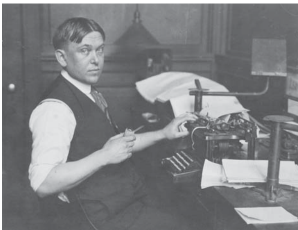
H. L. Mencken at his typewriter. Details at www.epfl.net/exhibits/mencken/guidelines.html.

No one in this world, so far as I know . . . has ever lost money by underestimating the intelligence of the great masses of the plain people.