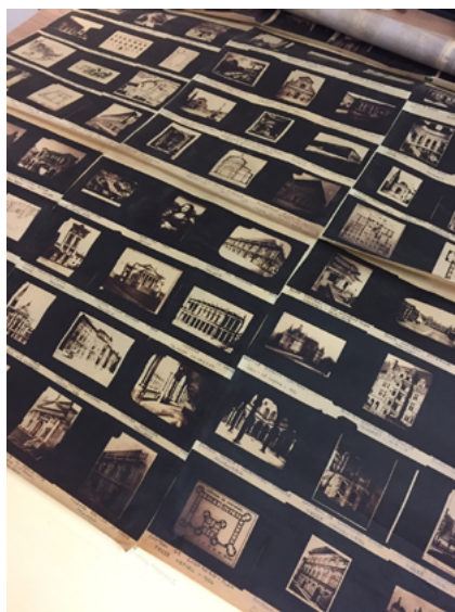
Glass slides from the University of Oklahoma Libraries American School of Architecture Archive.

In addition, the Christopher C. Gibbs College of Architecture, in collaboration with the OU Libraries, has received a grant from the National Endowment for the Arts to create a digital portal to the collection. "The American School of Architecture: An Interactive Database" will present an illustrated history of OU's contribution to architectural pedagogy and practice. More information is available at https://libraries.ou.edu/content/nine-american-school-architecture-collections-now-available-research .