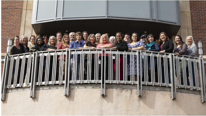
Santa Rosa Junior College Libraries staff.