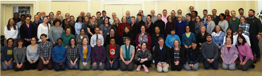
University of Maryland Libraries staff.

As one example of its exemplary commitment to the campus community, the libraries joined an emergency rapid response team in providing support for the campus in a time of crisis following a firestorm in October 2017