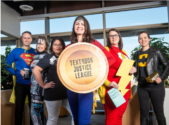
Nevada State College Marydean Martin Library staff.